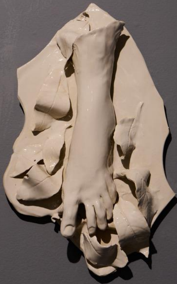
Untitled, 2022 Glazed porcelain 40 x 35 x 10 cm