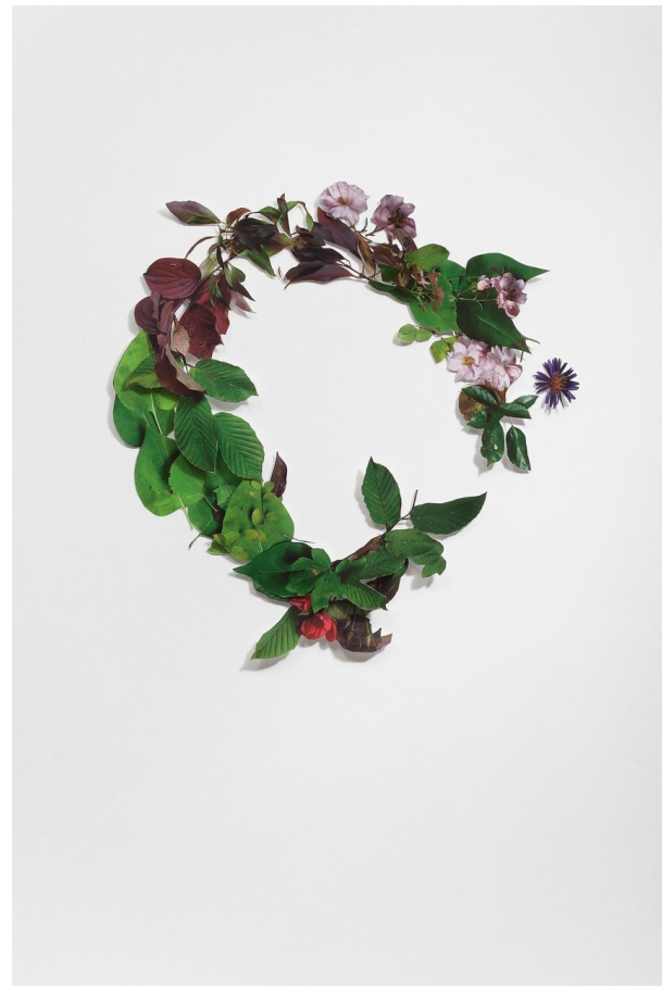
Fichte series (Fir tree), 2015 Inkjet print on archival paper, ed. 5 61 x 46 cm each