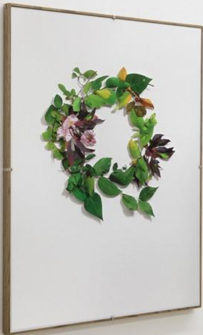
Fichte series (Fir tree), 2015 Inkjet print on archival paper, ed. 5 61 x 46 cm