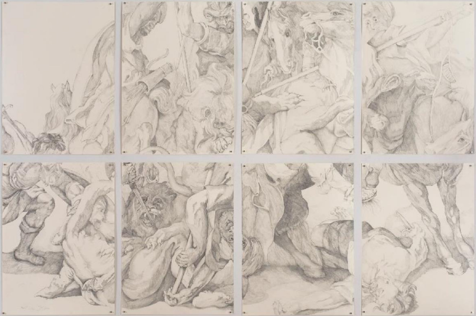
Crypt, 2019 Pencil on paper, 50 x 70 cm each (8 parts), US$ 12,000