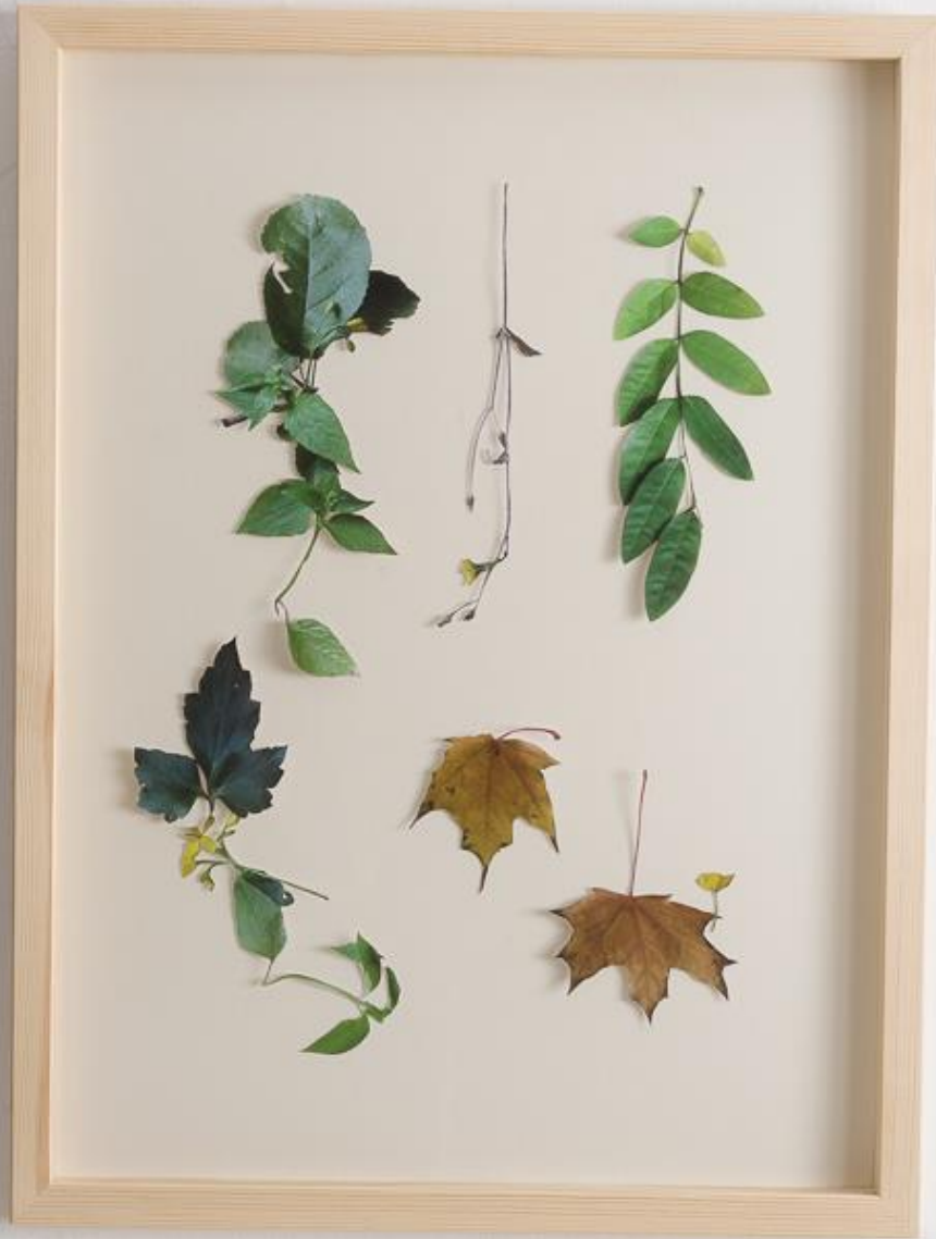
Timion series, 2016 Inkjet print on archival paper, ed. 3 65 x 40 cm