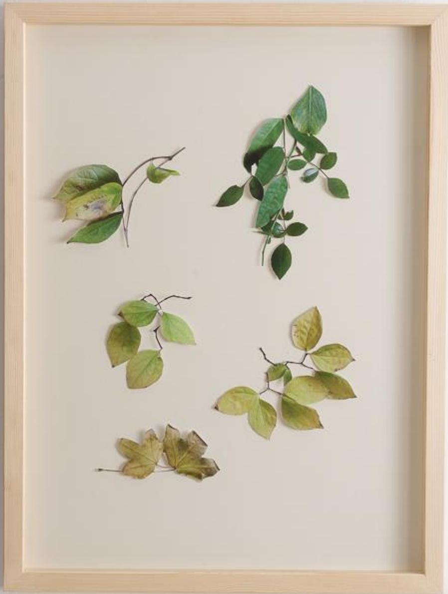
Timion series, 2016 Inkjet print on archival paper, ed. 3 65 x 40 cm