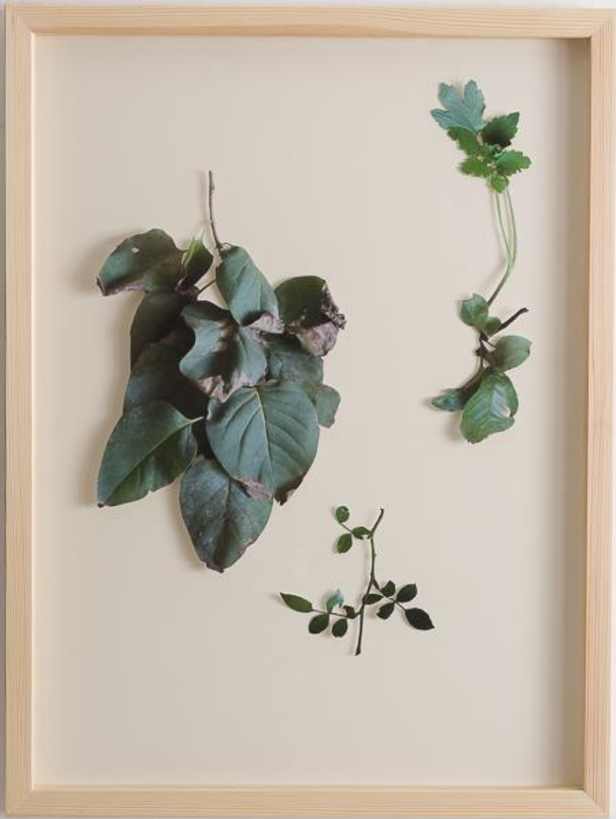
Timion series, 2016 Inkjet print on archival paper, ed. 3 65 x 40 cm