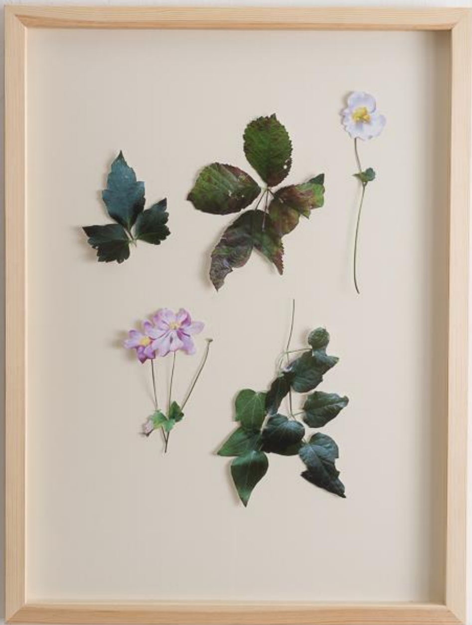
Timion series, 2016 Inkjet print on archival paper, ed. 3 65 x 40 cm