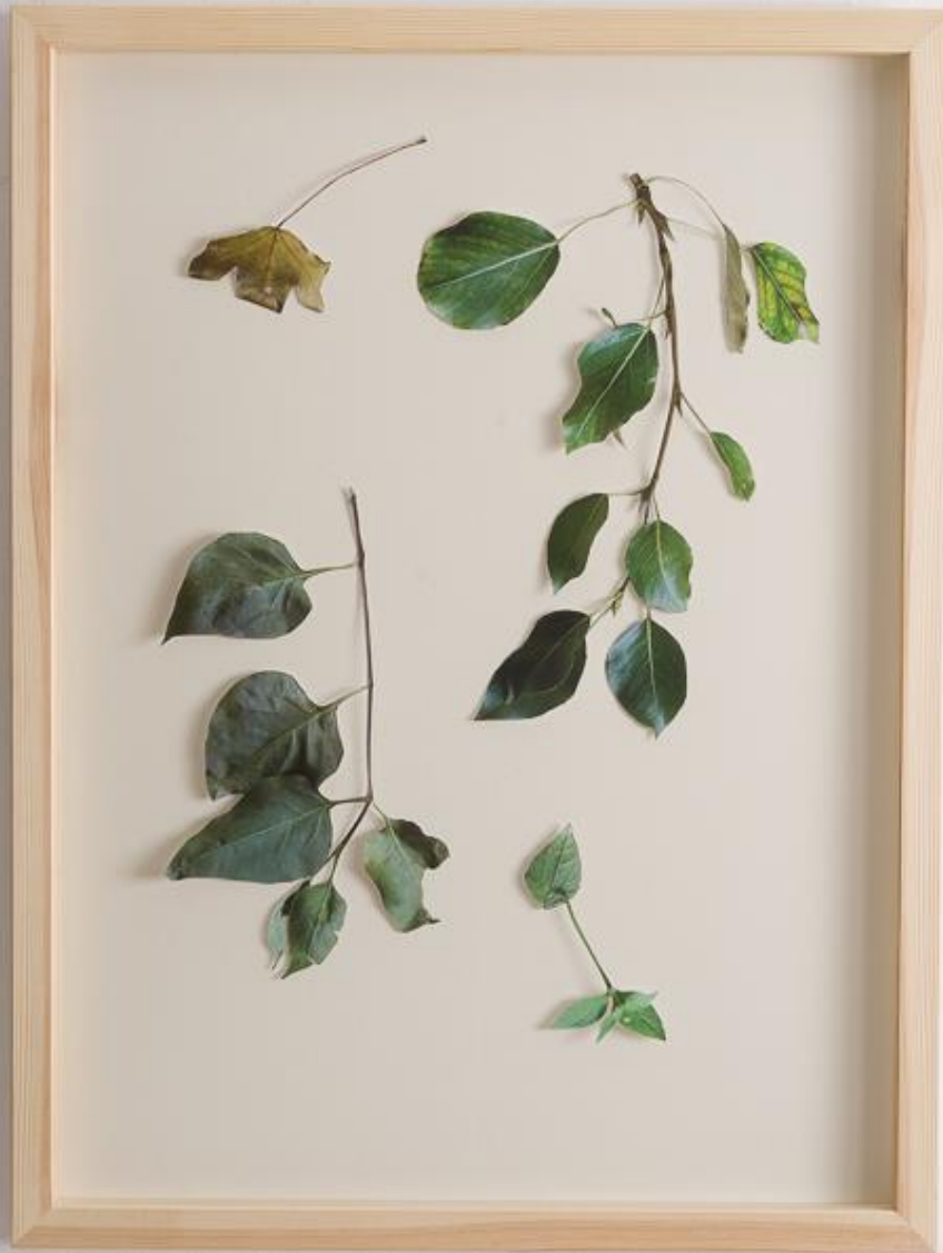
Timion series, 2016 Inkjet print on archival paper, ed. 3 65 x 40 cm