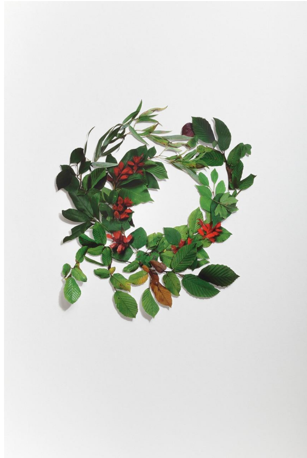
Fichte (Fir tree), 2015 Inkjet print on archival paper, ed. 5 61 x 46 cm each