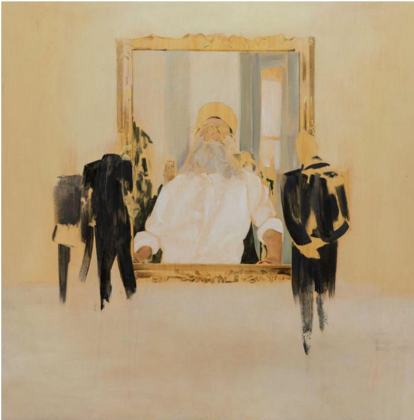
The Scream, 2020 Oil on wood 110 x 90 cm