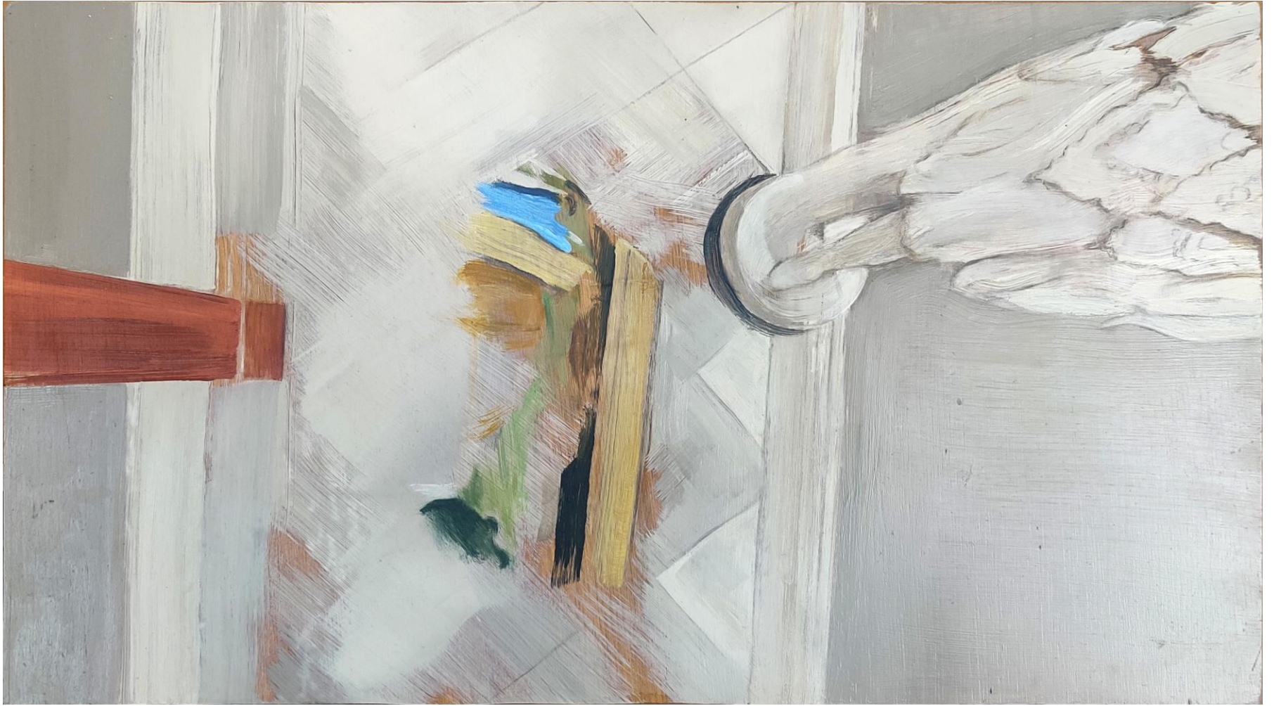
Sculpture, Painting, Podium, 2023 Oil on canvas 30 x 44 cm