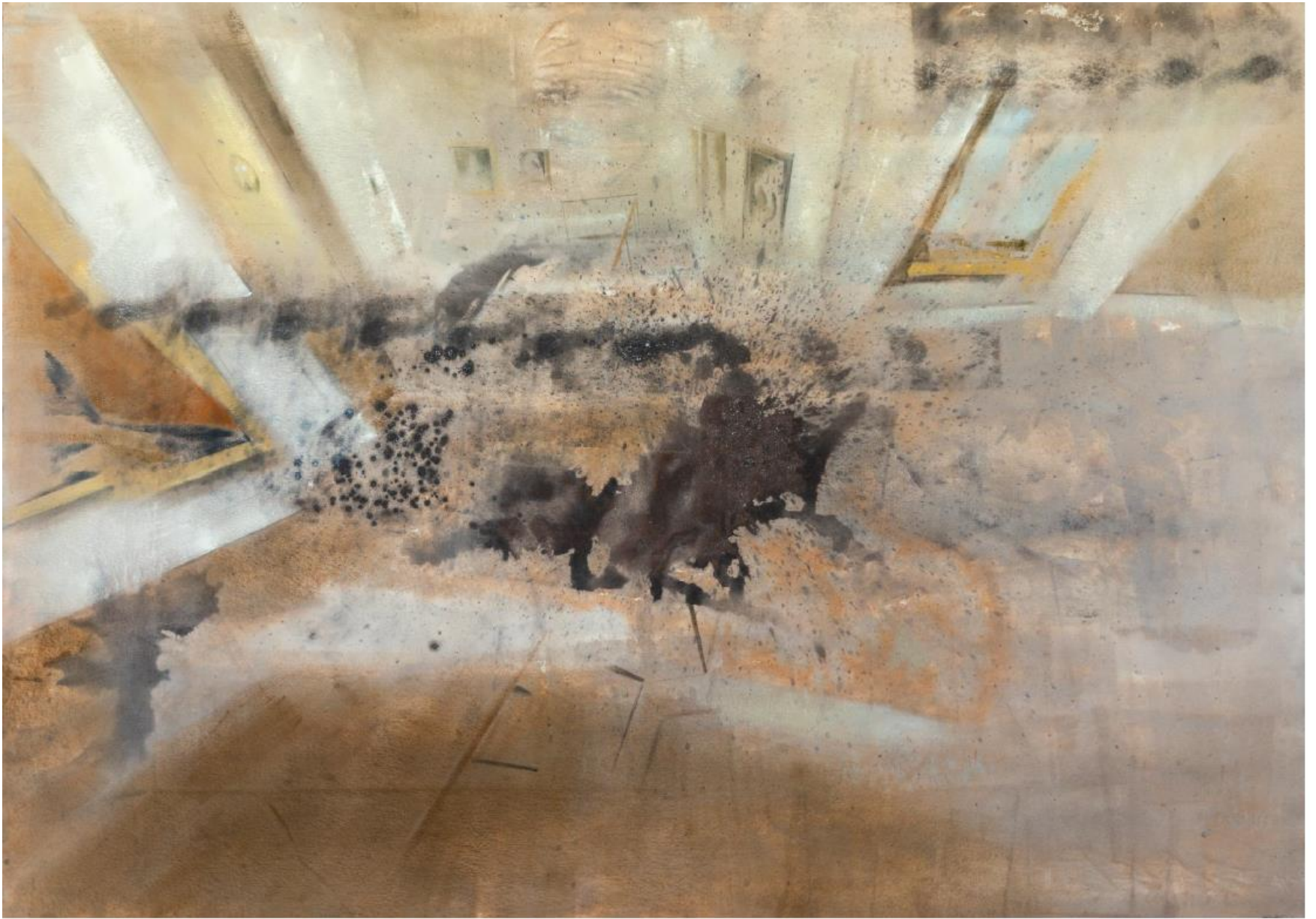
Abstract Display Appearance, 2022 Oil on wood 167 x 212cm