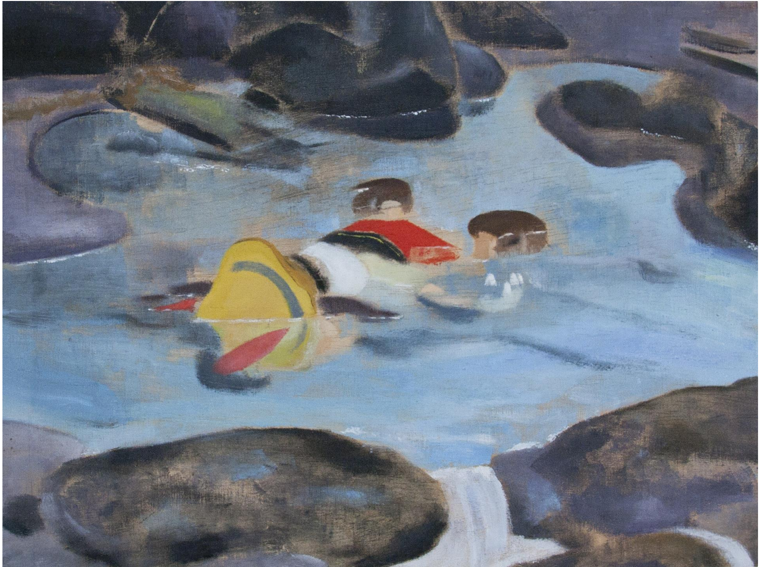
Pinocchio Downfall, 2023 Oil on wood 35 x 47 cm