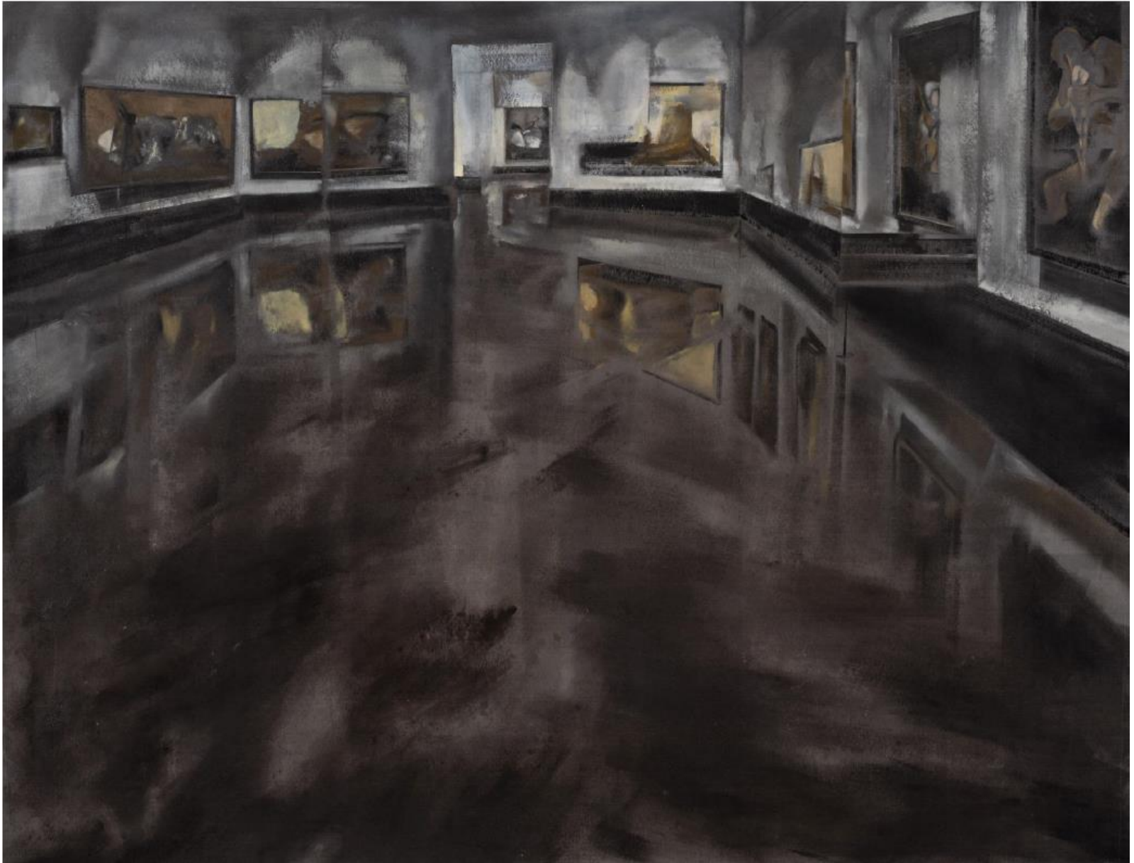
Black Reflections, 2021 Oil on canvas 167 x 216 cm