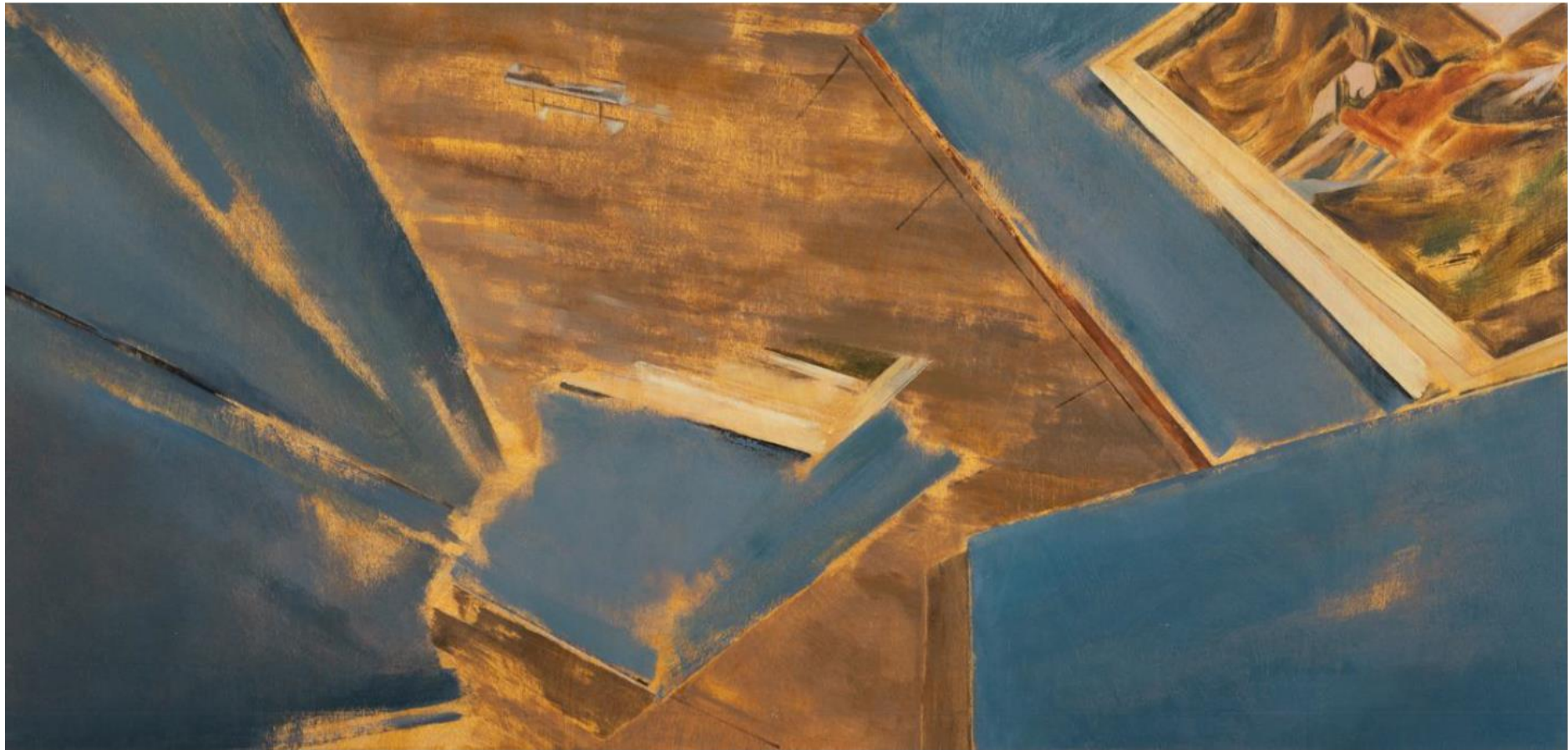
A Broken View, Musee d'Orsay, 2021 Oil on canvas 55 x 115 cm