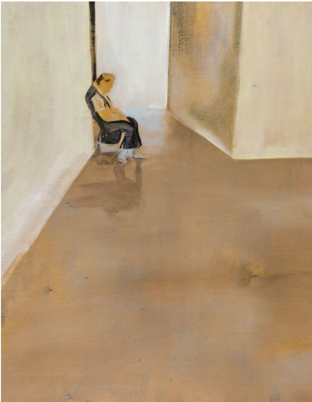
Sleeping Guard, 2021 Oil on canvas 90 x 70 cm