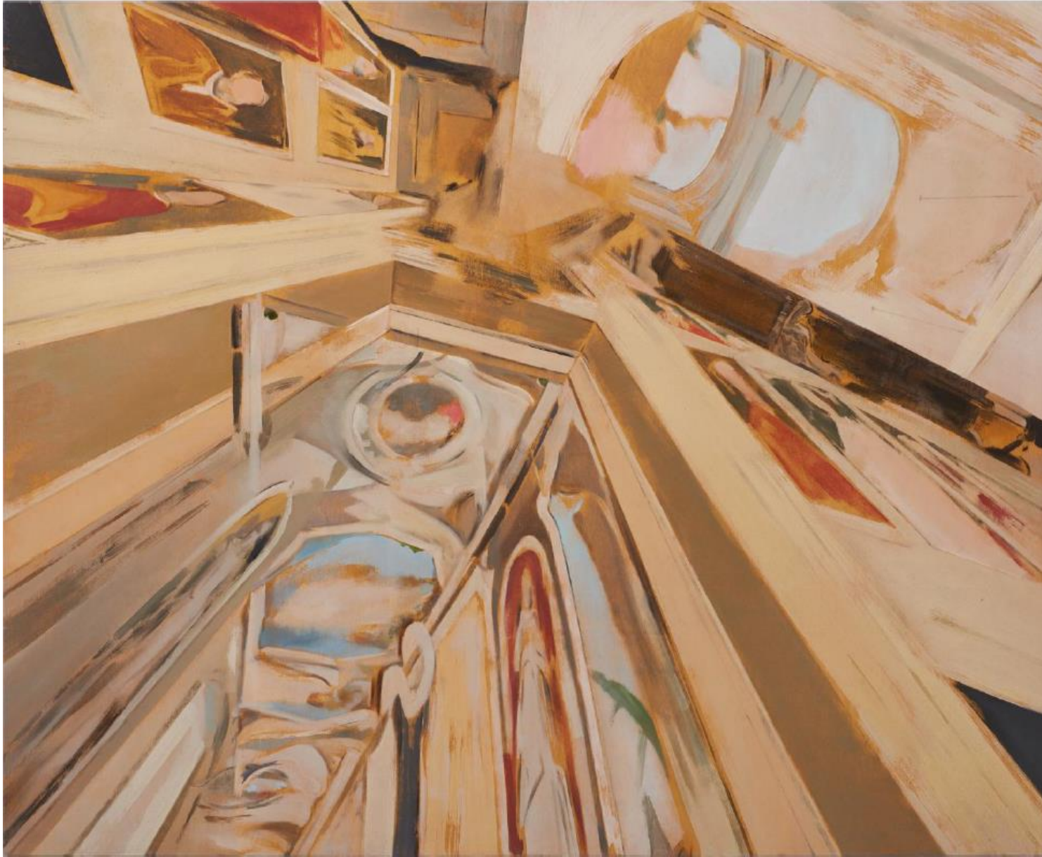
Untitled, 2022 Oil on wood 80 x 110 cm