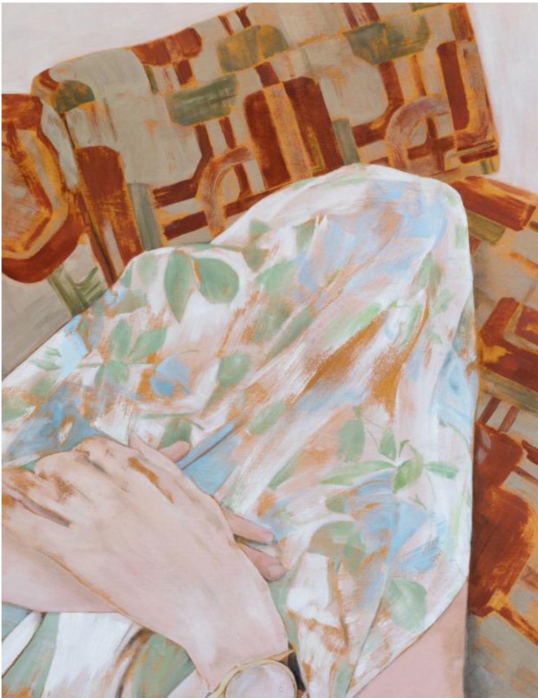
Under the Blanket, 2022 Oil on canvas 90 x 70 cm