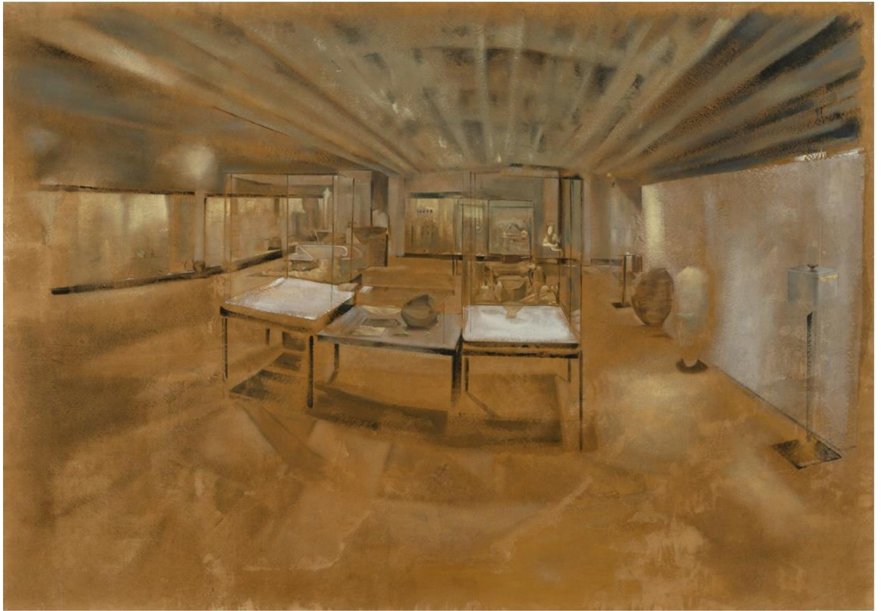
Shades of archeology, 2021 Oil on canvas 150x205cm