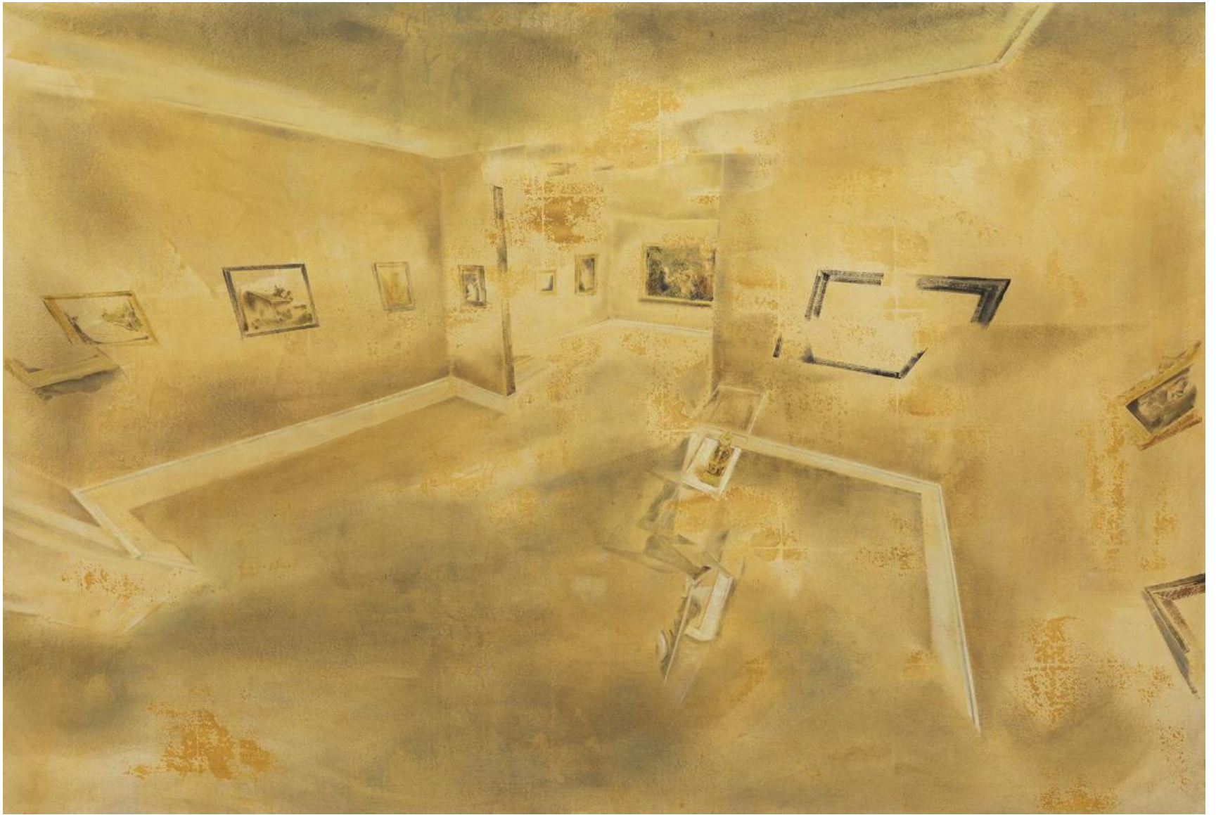
Face Down, 2021 Oil on canvas 140 x 205 cm