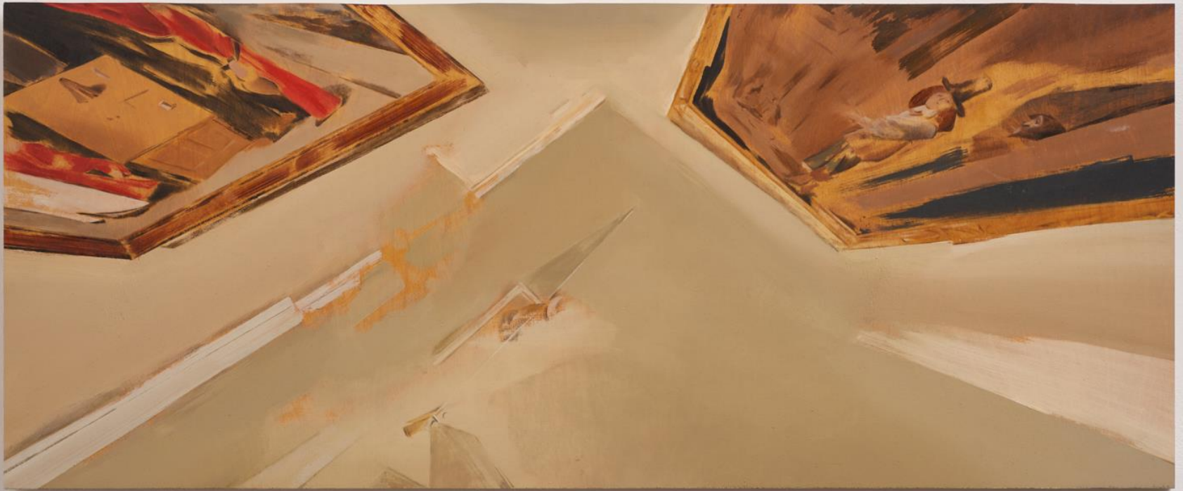
Four Corners, 2021 Oil on wood 45 x 116 cm