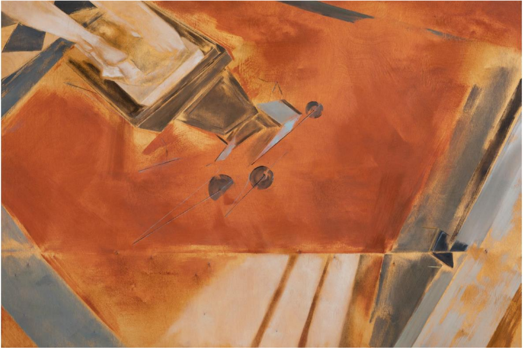
Above the Podium, 2021 Oil on wood 80 x 110 cm