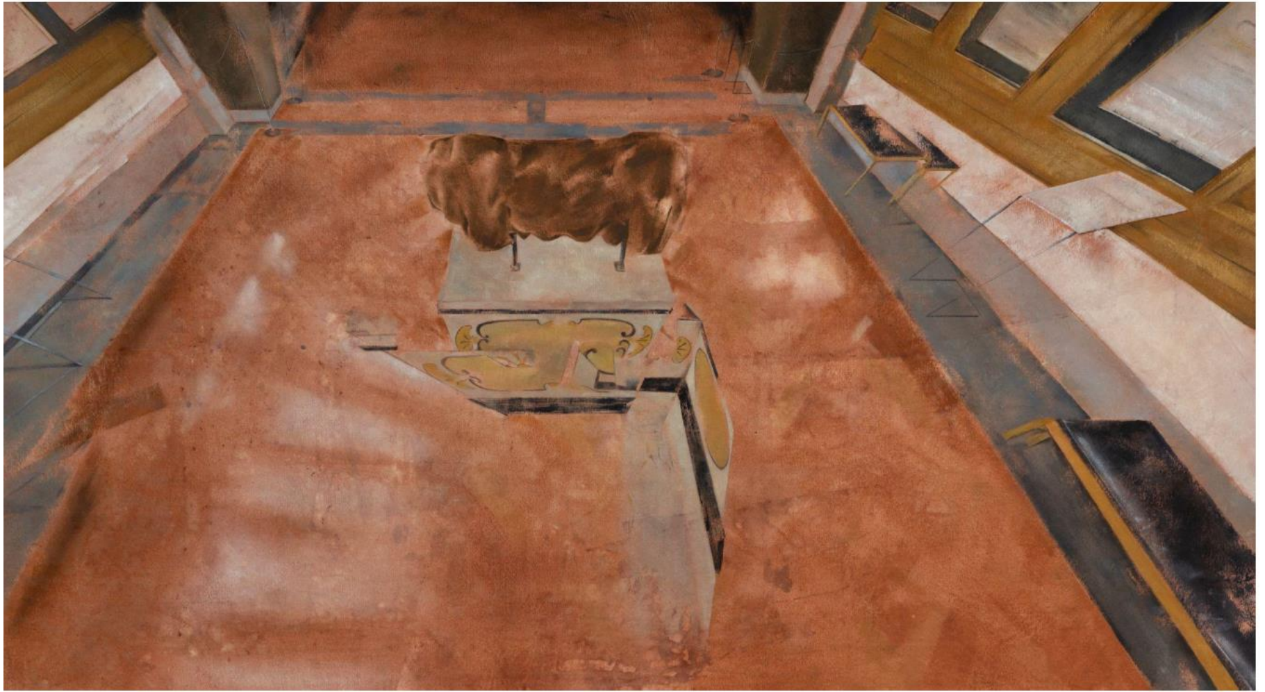
Virtual Tour at the Uffizi (no. 4), 2021 Oil on canvas 150 x 210 cm