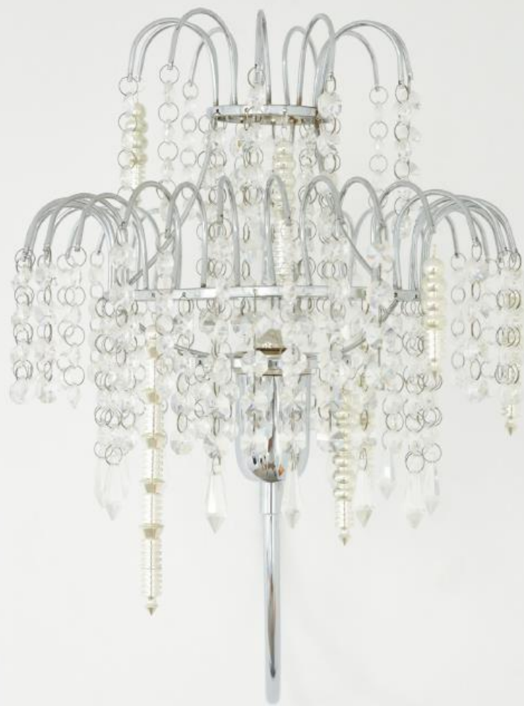
Untitled, 2023 Revised chandelier, metal bars and pendulums Dimensions vary