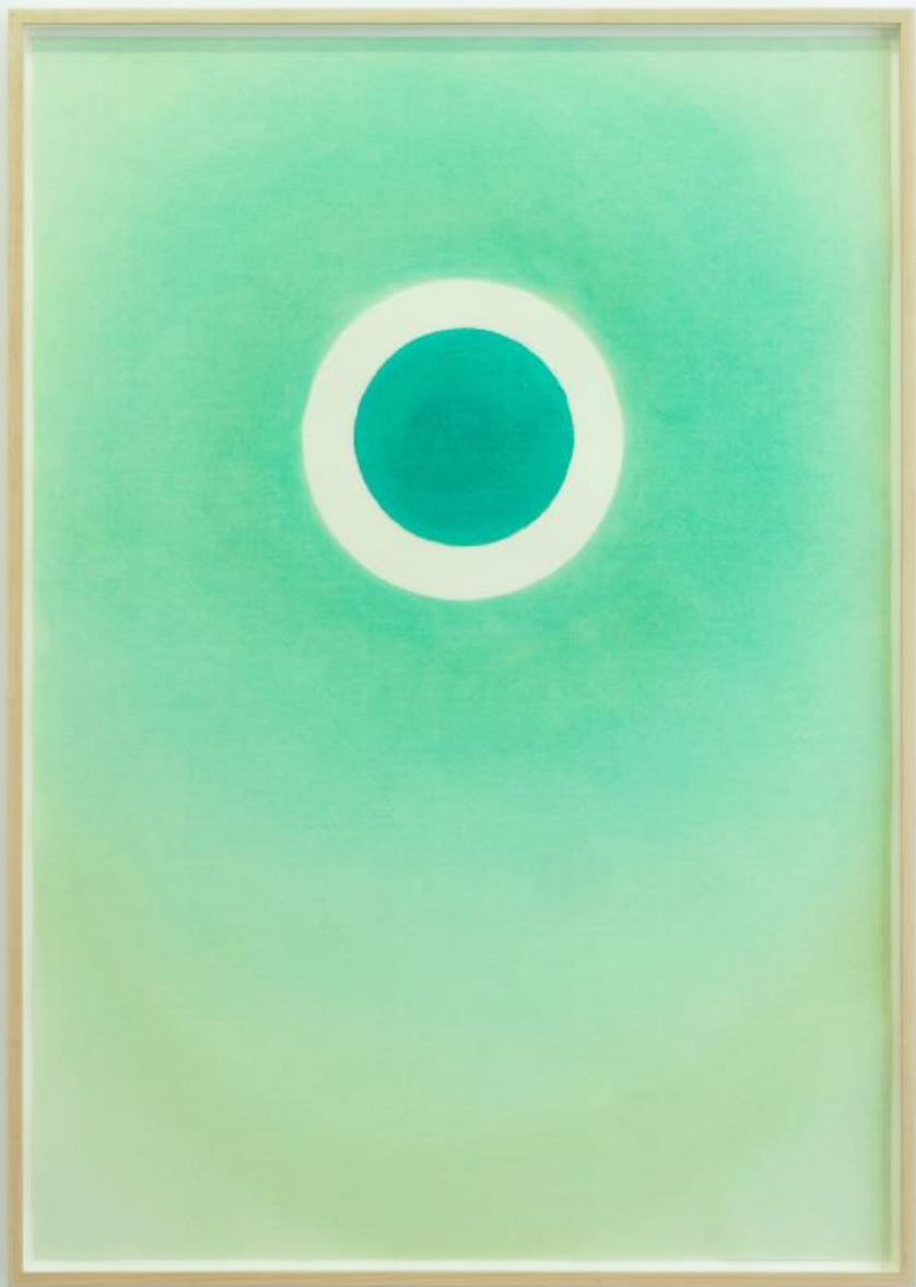
Chameleon series – Turquoise, 2023 Pastel on paper 102x72