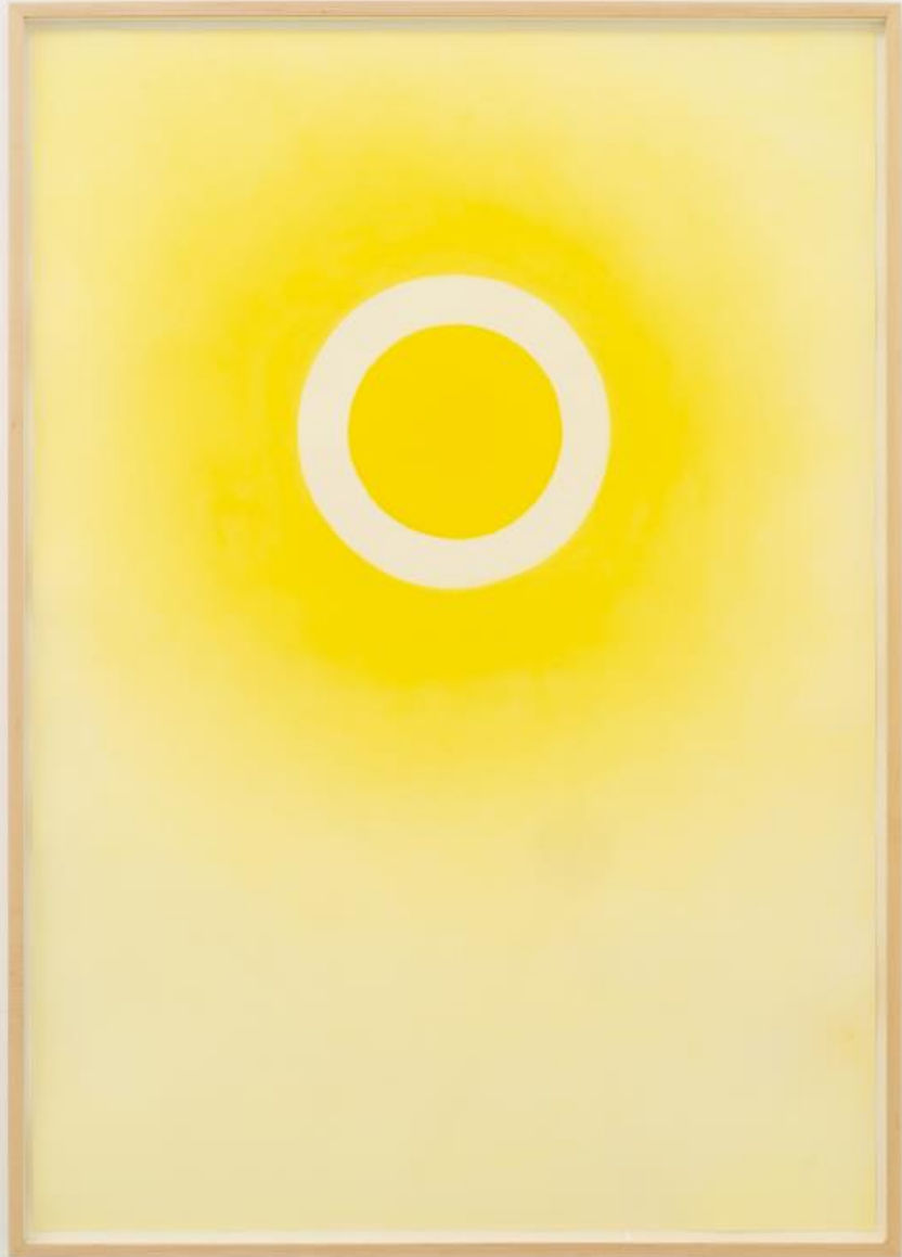
Chameleon series – Topaz, 2023 Pastel on paper 102x72