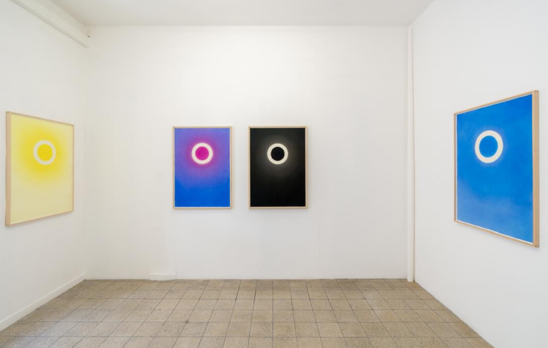
Chameleon Series, 2023 – installation view MFA graduates show, Bezalel Academy of Art and Design