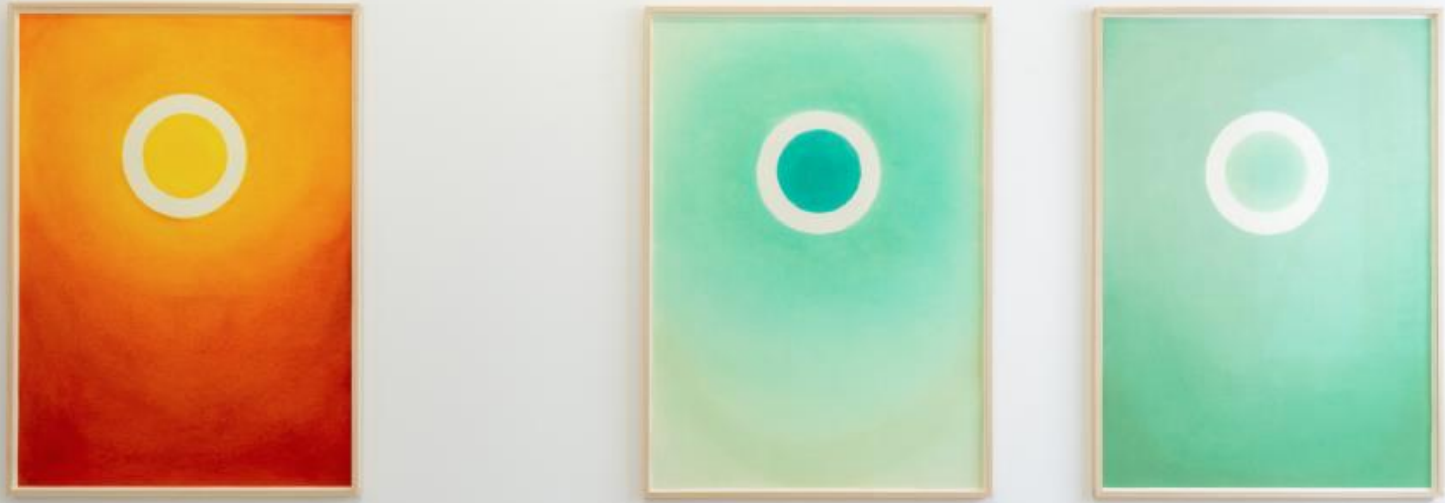
Chameleon Series, 2023 – installation view MFA graduates show, Bezalel Academy of Art and Design