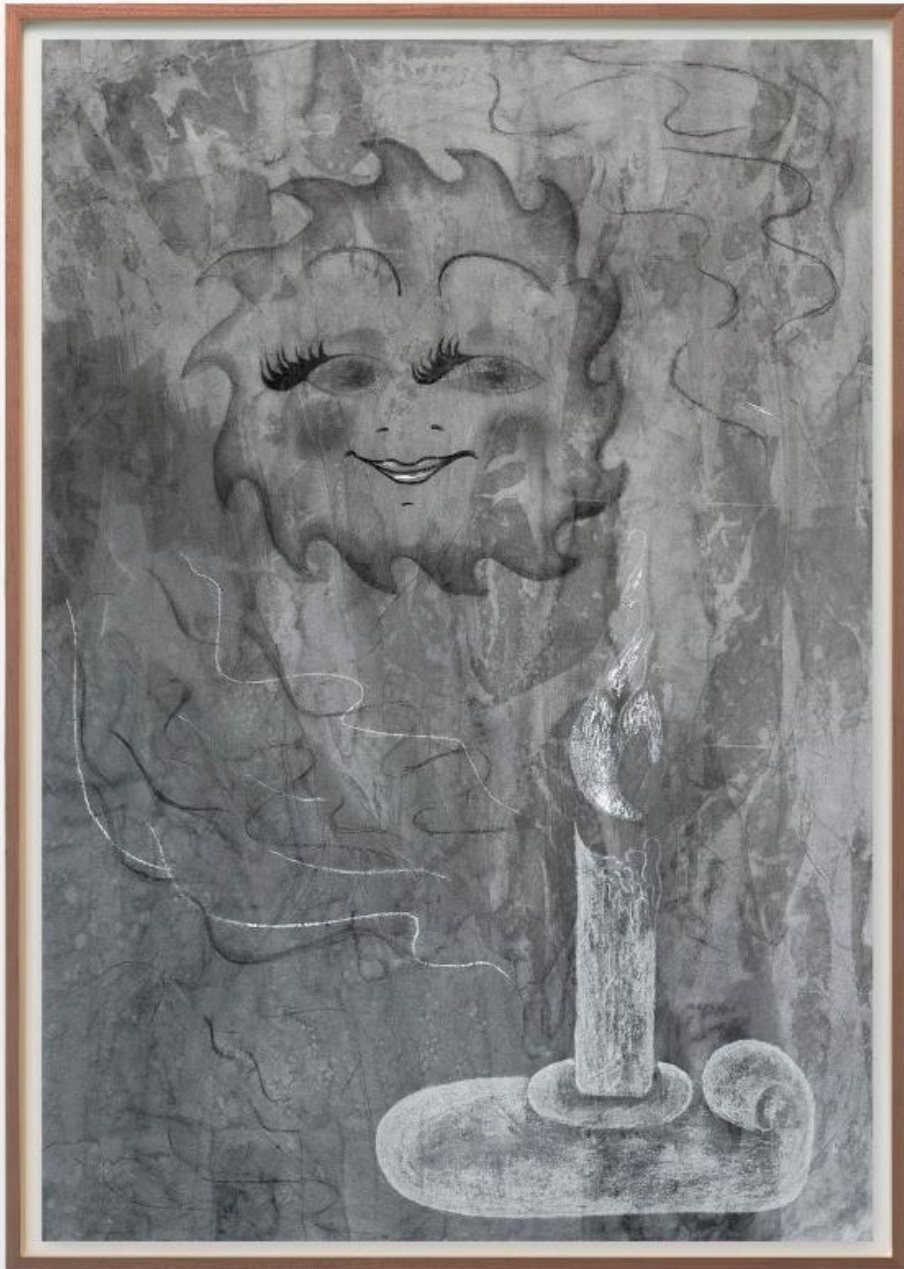
Sun, 2019 Charcoal, chalk and pastel on paper 100x70cm