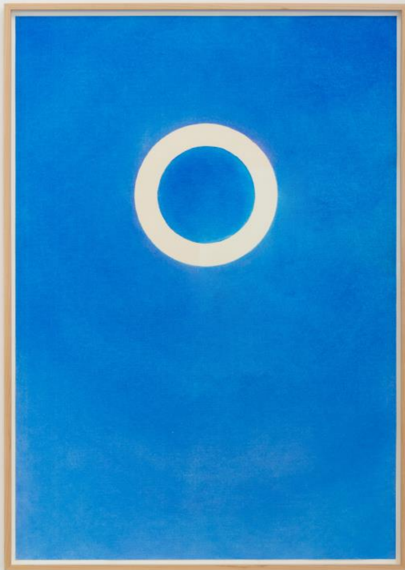
Chameleon series – Lapis Lazuli, 2023 Pastel on paper 102x72

Chameleon series comprises 7 drawings based on 'Mood Ring' - a popular jewelry invented in New York in the 1970's, which changes its color following the person's body temperature. Each work captures a specific mindset based on the original Ring's index.