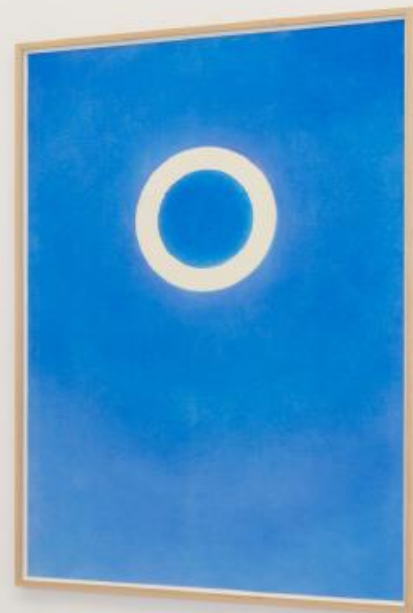
Chameleon Series, 2023 – installation view MFA graduates show, Bezalel Academy of Art and Design