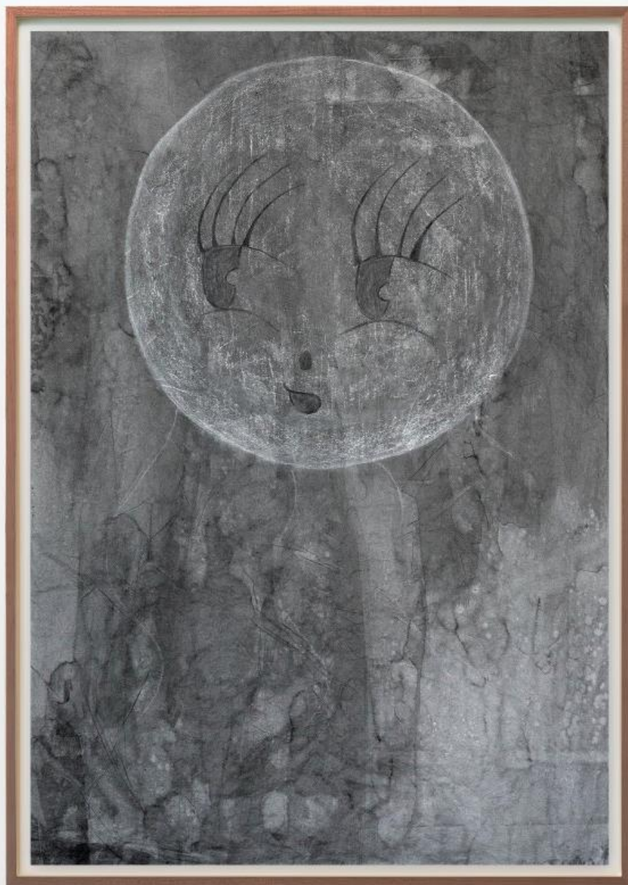
Moon, 2019 Charcoal, chalk and pastel on paper 100x70cm