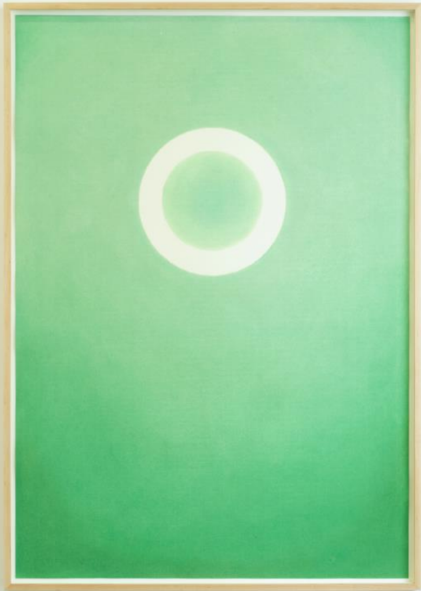
Chameleon series – Emerald, 2023 Pastel on paper 102x72