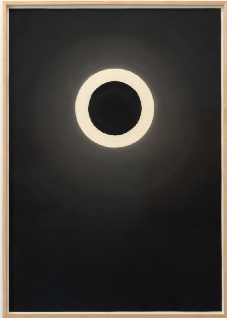
Chameleon series – Onyx, 2023 Pastel on paper 102x72