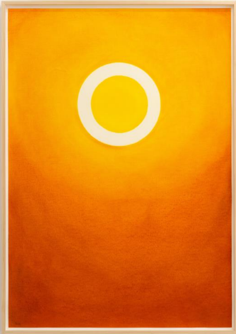
Chameleon series – Ambar, 2023 Pastel on paper 102x72