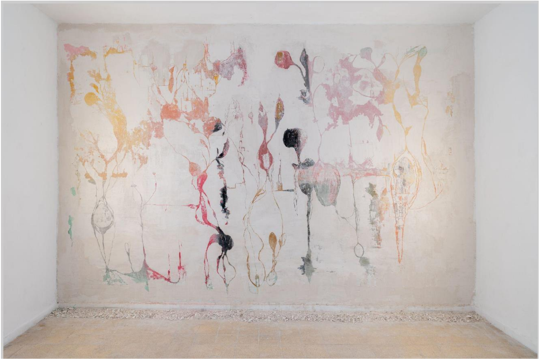
Emerging System, 2022

Sgraffito on layers of paint, pigments and plaster on fabric, attached to a wall 400 x 500 cm