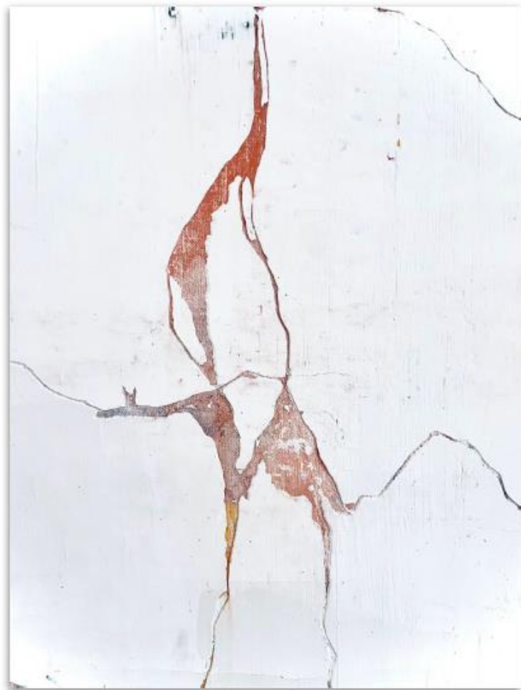
Symbiosis of landscape series (detail), 2023 Sgraffito on fabric 190 X 150 cm