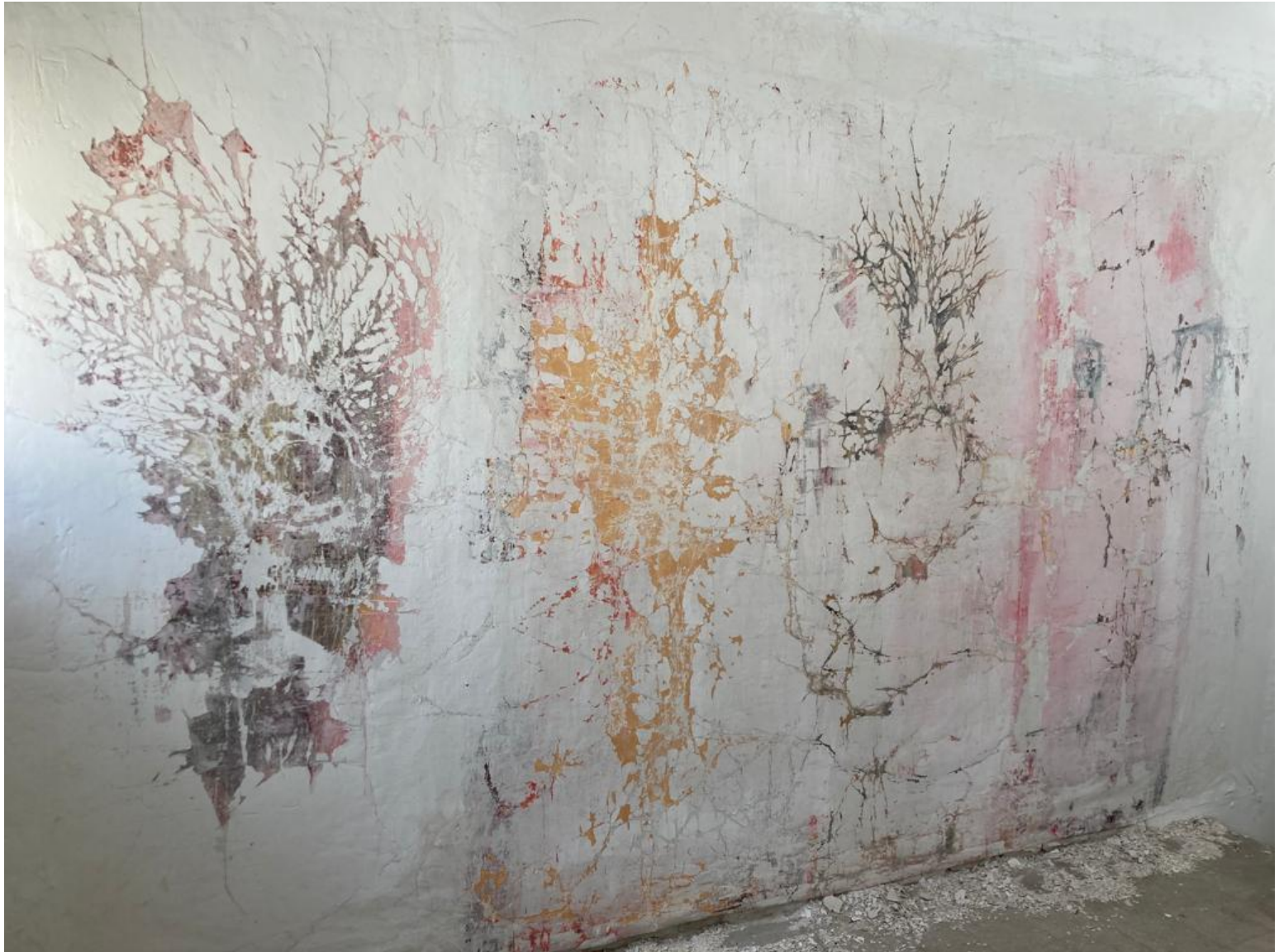
Flowers, 2021 Sgraffito on layers of paint, pigments and plaster on fabric, attached to a wall 300 x 400 cm