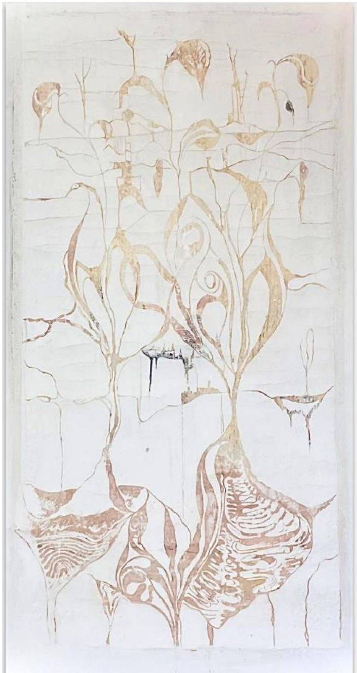
Symbiosis of landscape (series), 2023 Sgraffito on fabric 170 X 100 cm