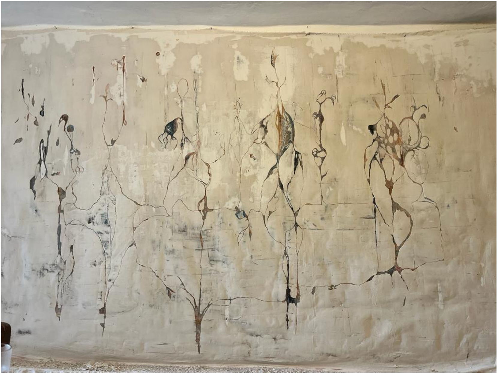
Not titled yet, 2023 Sgraffito on layers of paint, pigments and plaster on fabric 130 X 250 cm