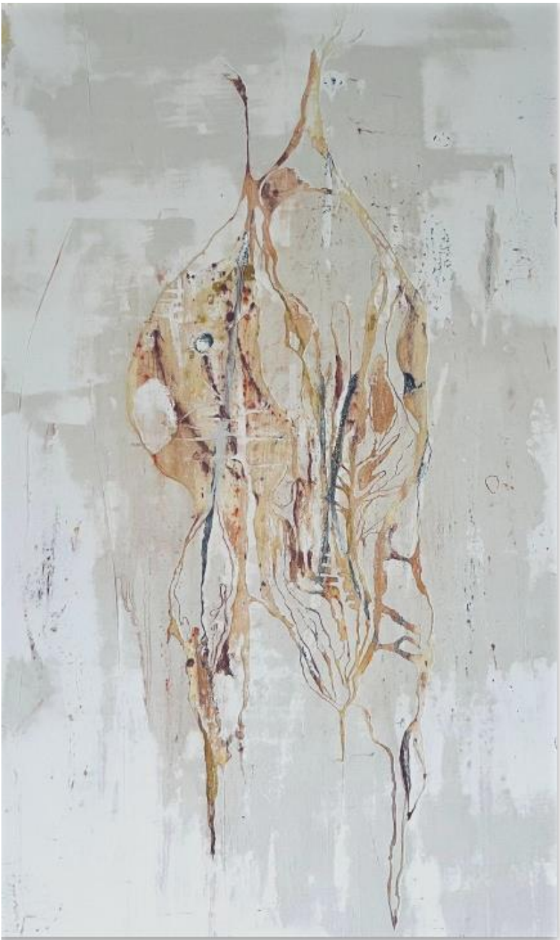
Symbiosis of landscape series, 2024 Sgraffito on fabric 125 x 65 cm