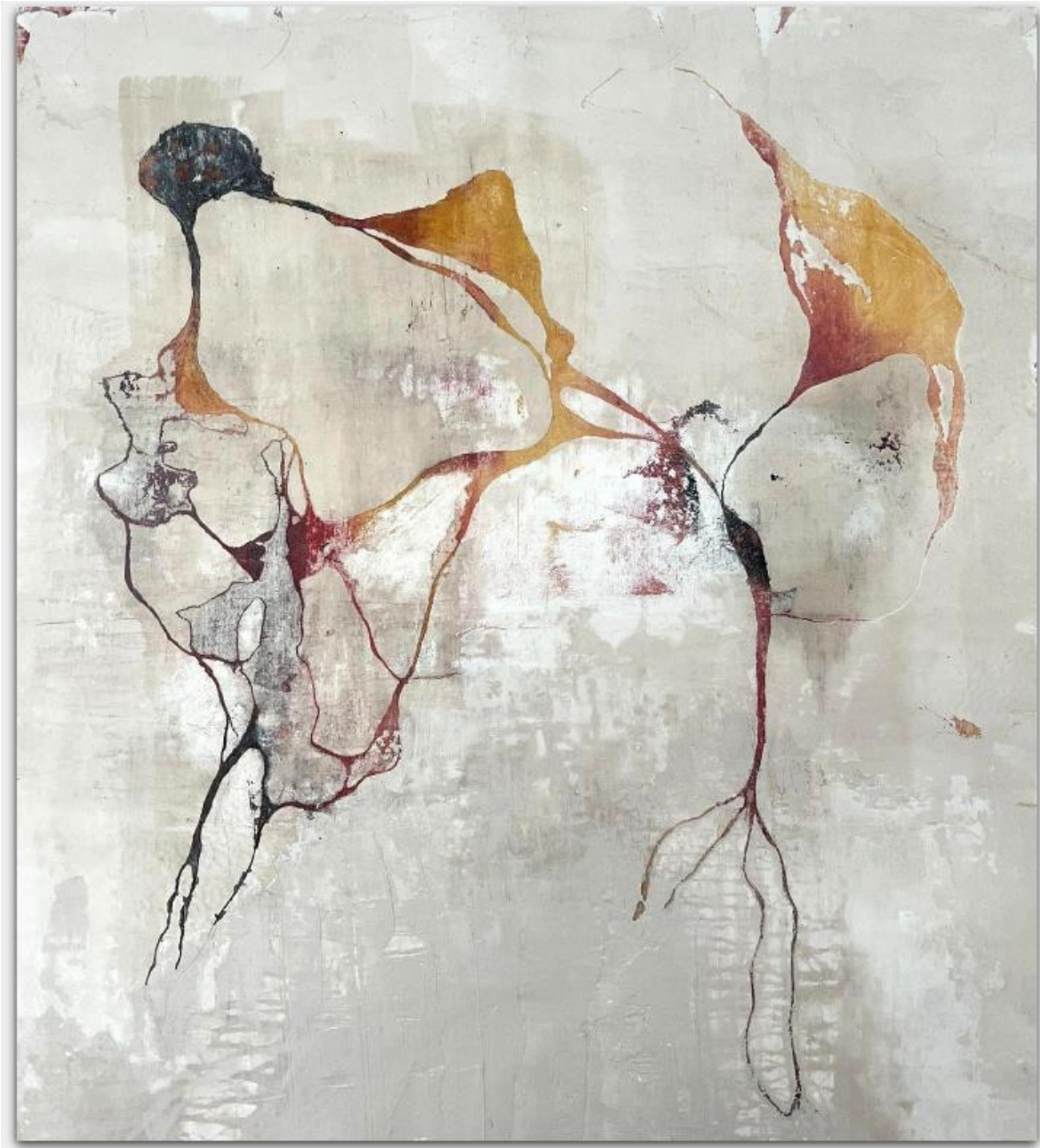
Symbiosis of landscape series, 2023 Sgraffito on fabric 100 x 100 cm