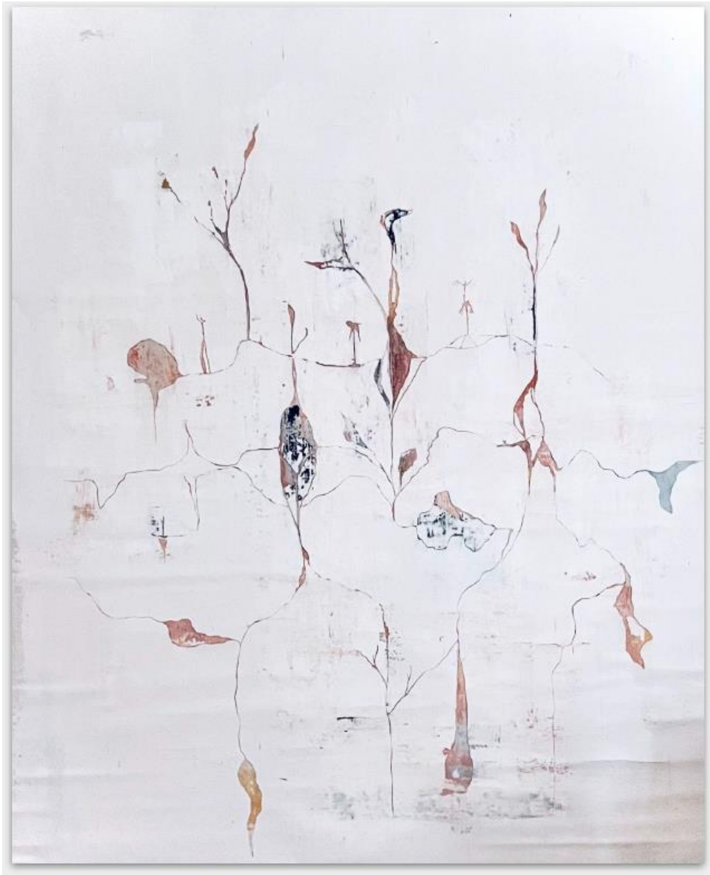
Symbiosis of landscape series, 2023 Sgraffito on fabric 190 X 150 cm