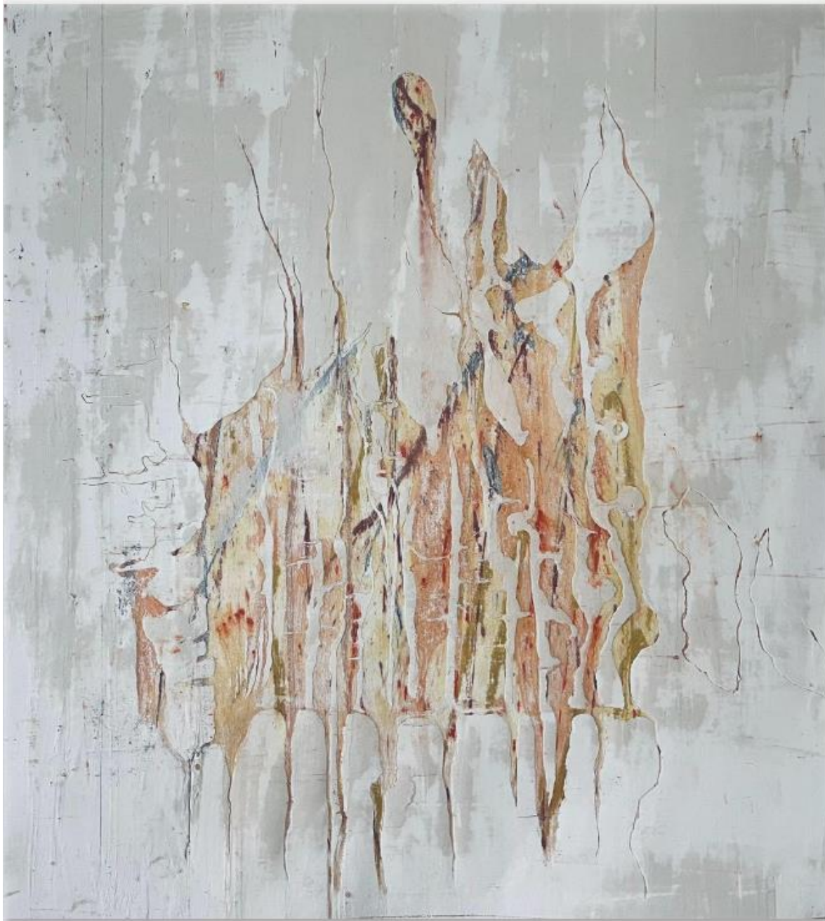
Symbiosis of landscape series, 2024 Sgraffito on fabric 100 x 100 cm