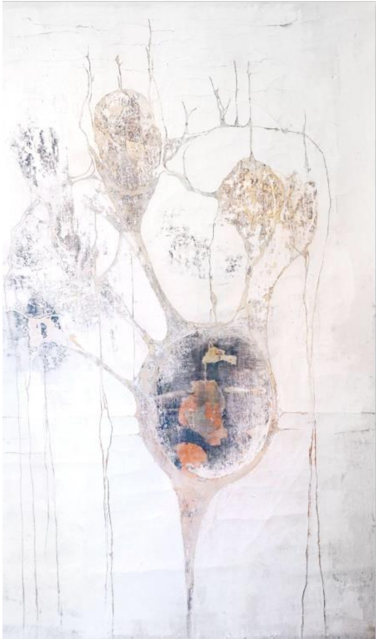
Symbiosis of landscape series, 2023 Sgraffito on fabric 170 X 100 cm