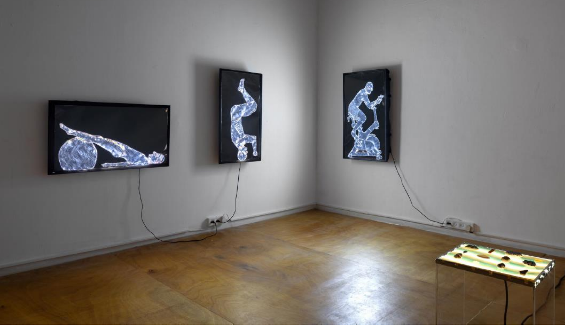
Limbotopia, 2019 – installation view Naama Roth's solo show at Kav 16 Gallery, Tel Aviv