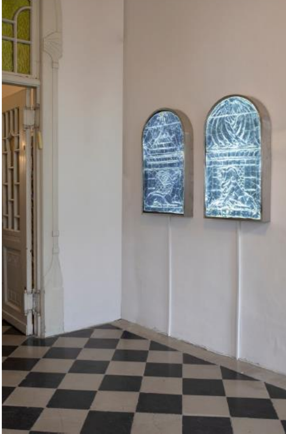
Lion and Doe, 2021 – installation view Mixed media (light box) 90 x 50 x 10 cm each