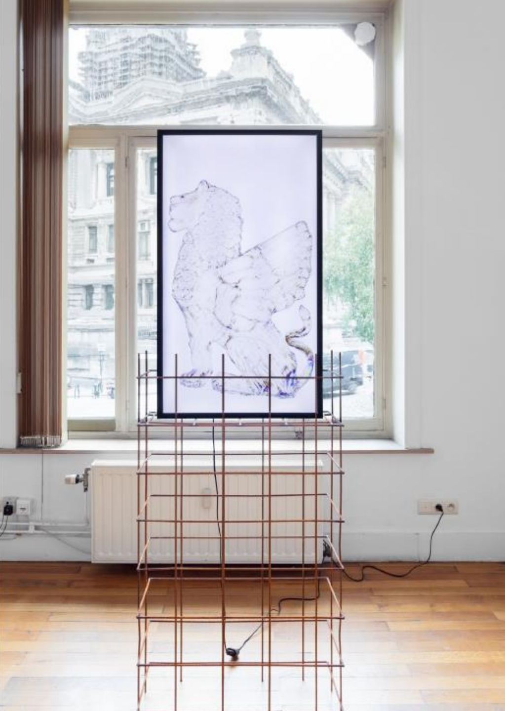
Guardian Lion, 2023 Mixed media (lightbox) 160 x 100 x 50 cm