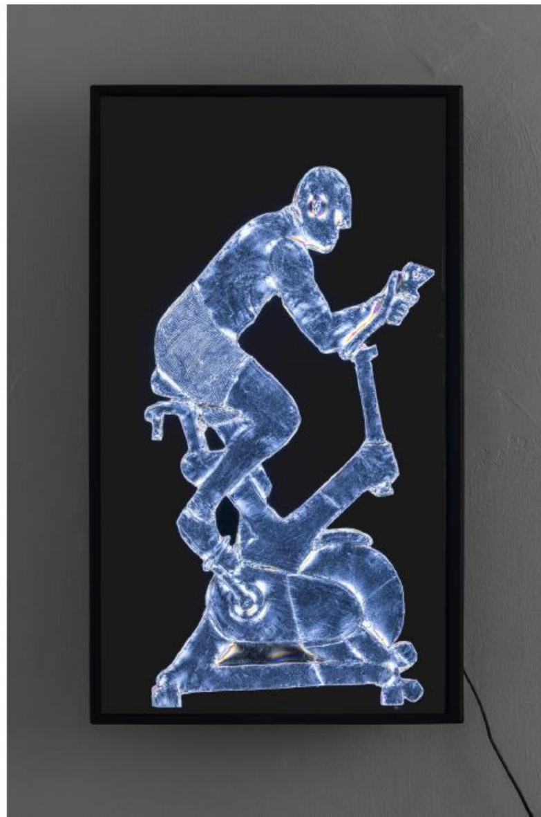
The Spinner, 2019 Mixed media (light box) 95 x 55 x 10 cm