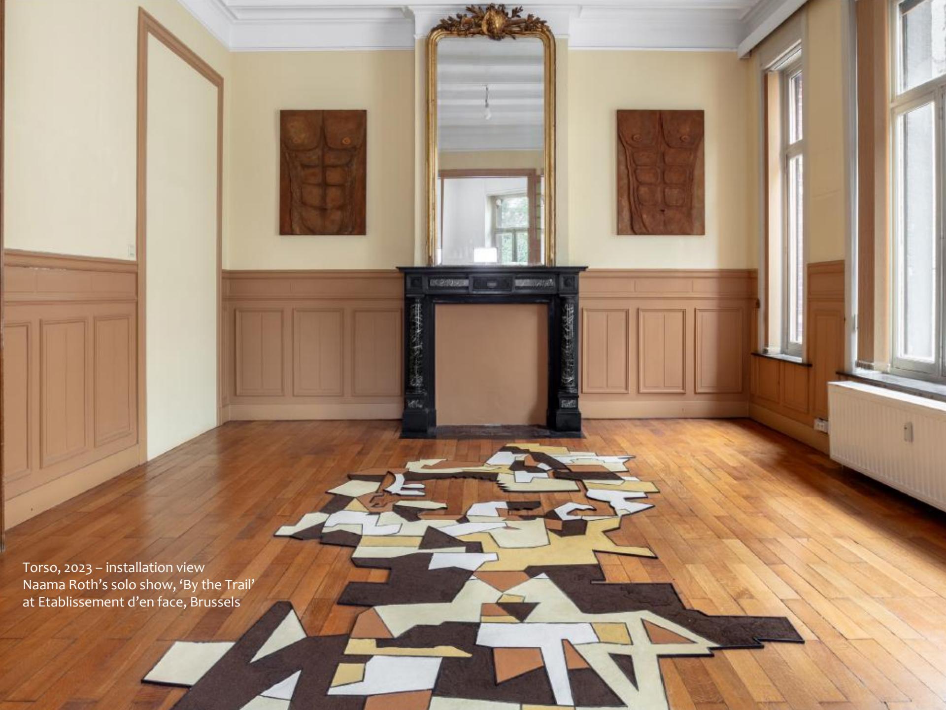
Torso, 2023 – installation view Naama Roth's solo show, 'By the Trail' at Etablissement d'en face, Brussels