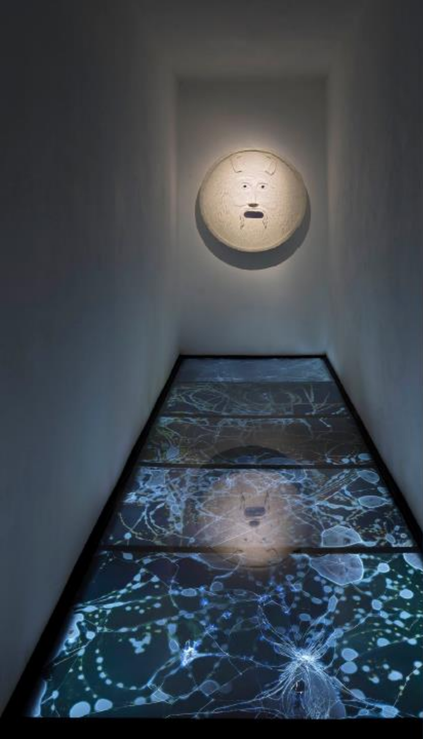
Mouth of Truth, 2021 – installation view Naama Roth' solo show at Offnobank space, Tel Aviv