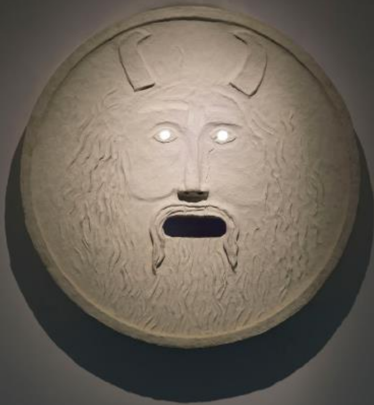
Mouth of Truth, 2021 Papier-mâché and LED 80 cm d.