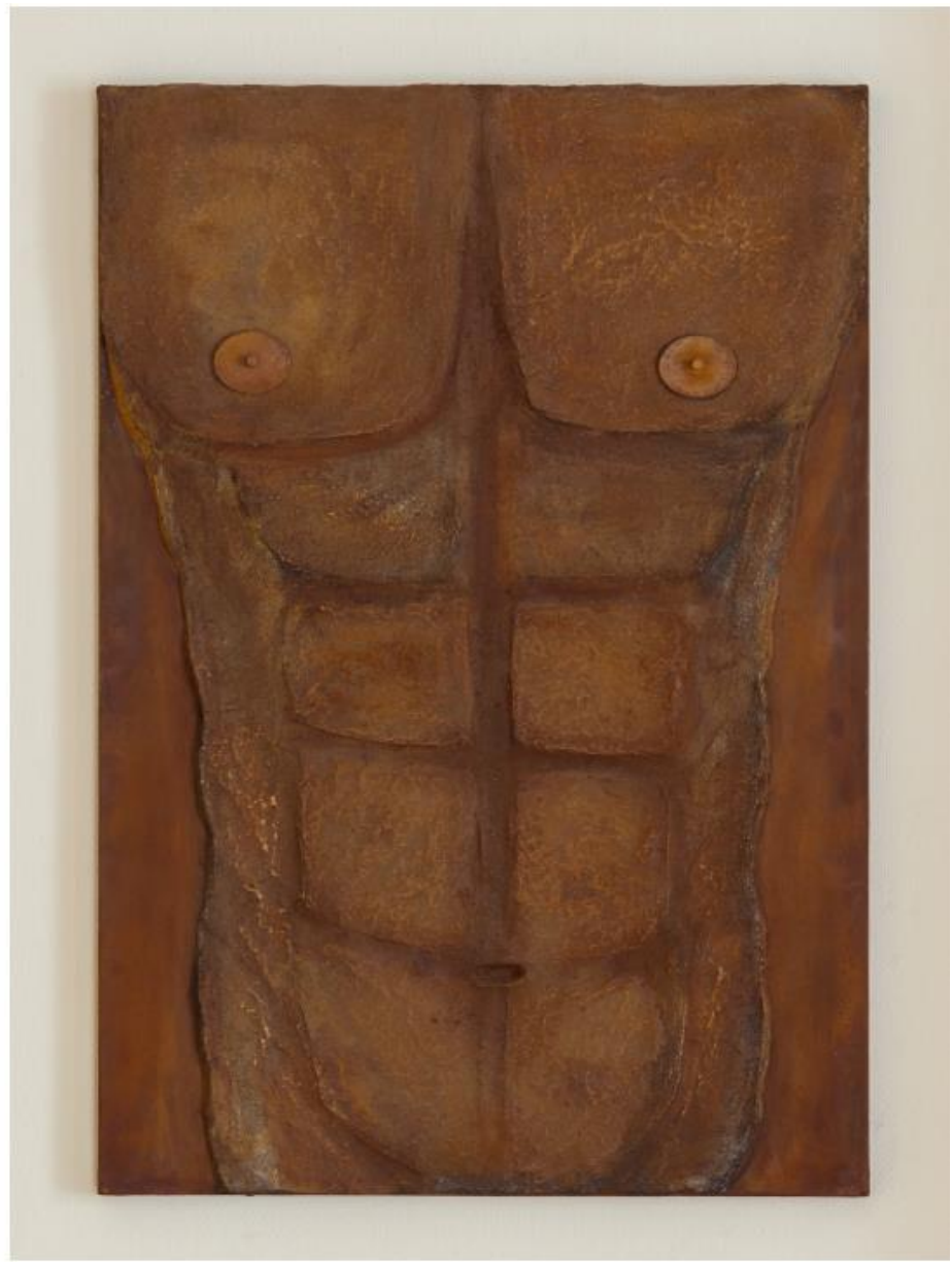
Torso, 2023 Mixed media 110 x 80 x 2 cm each