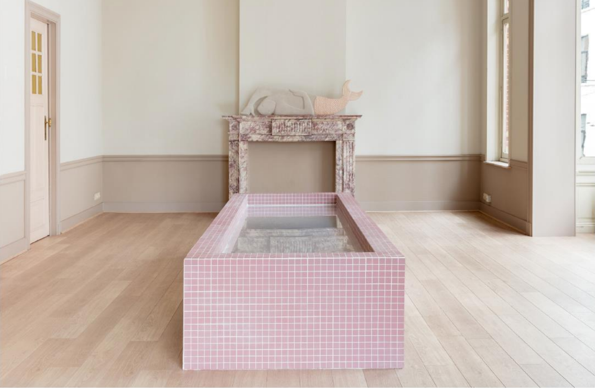
Merman, 2023 – installation view Naama Roth's solo show, 'By the Trail', at Etablissement d'en face, Brussels