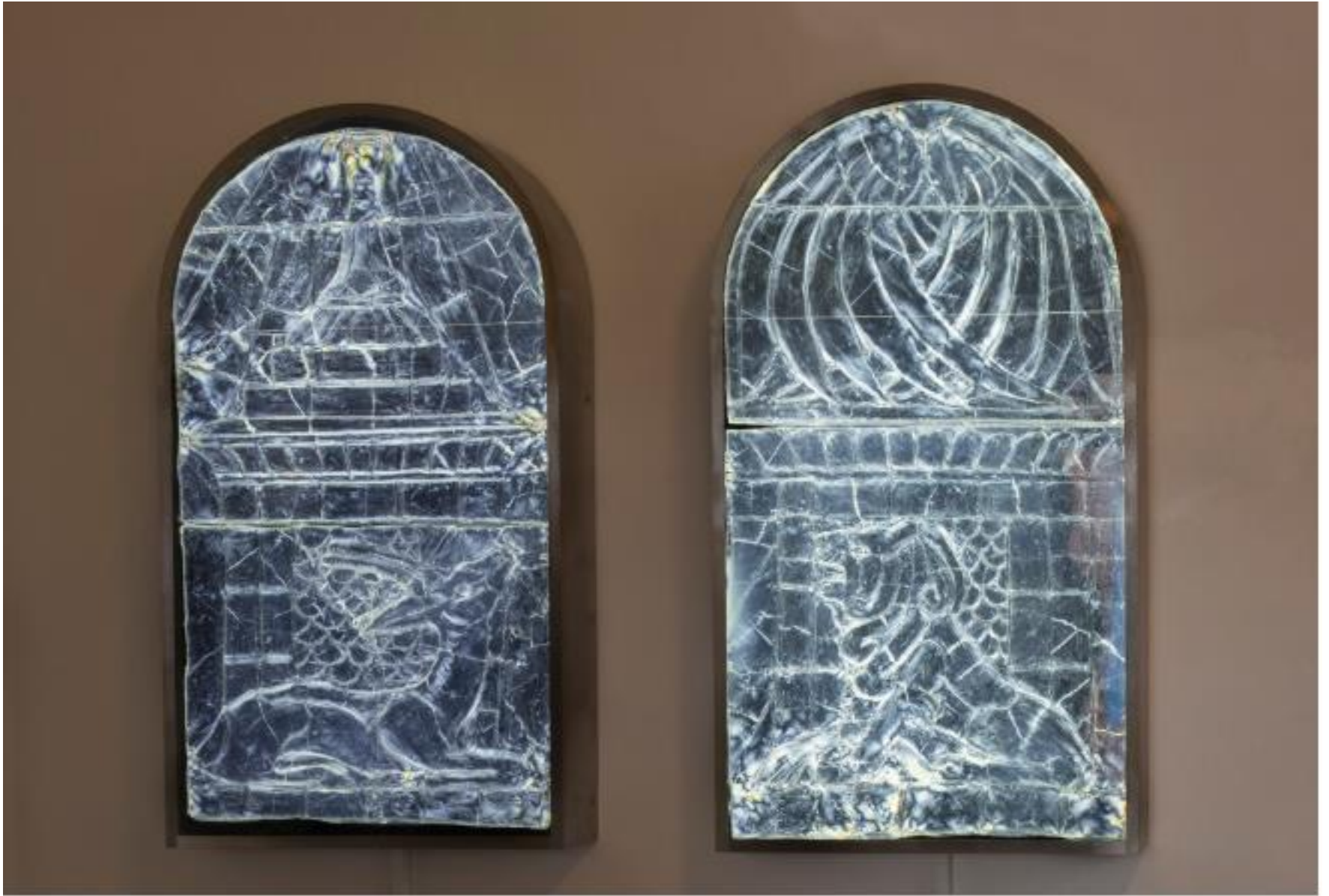
Lion and Doe, 2021 Mixed media (light box) 90 x 50 x 10 cm each