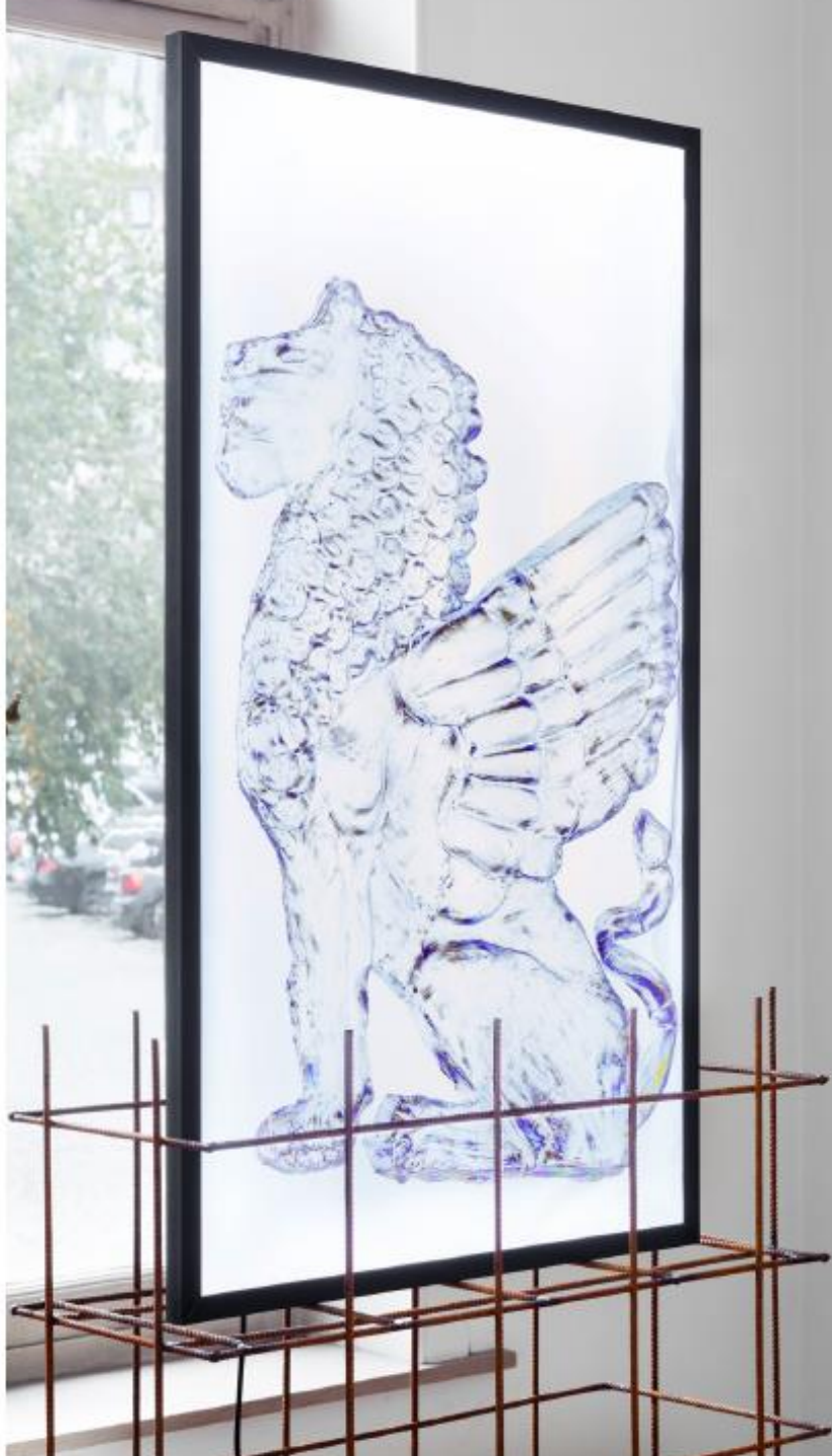
Guardian Lion, 2023 Mixed media (lightbox) 160 x 100 x 50 cm