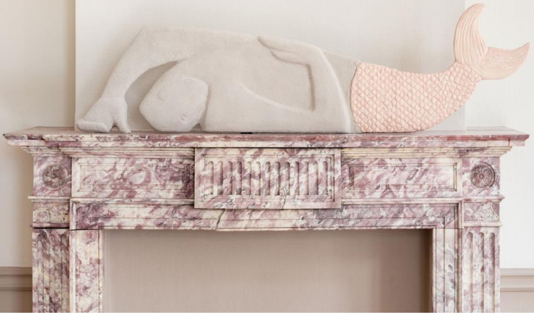
Merman, 2023 Sand, wood, clay and glaze 70 x 150 x 13 cm