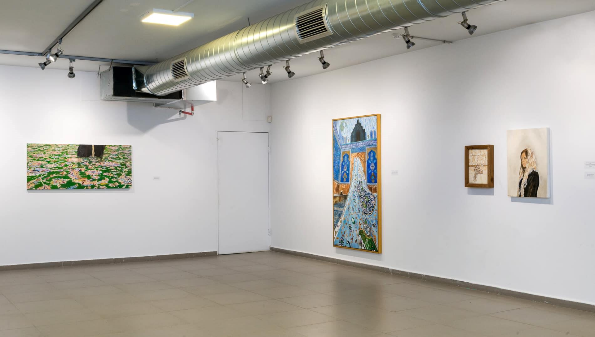
"In Between" – installation view, 2023 Solo exhibition by Assadi-Dabbah at Umm El-Fahem Gallery