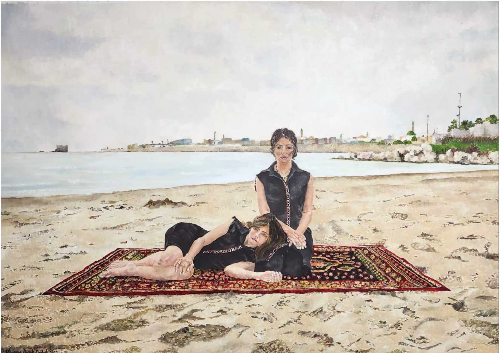
Two Women on the Sand, 2023 Oil on canvas 106 x 150 cm