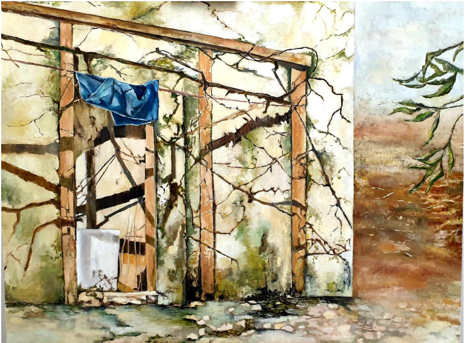
Fog, 2023 Oil on canvas 90 x 120 cm