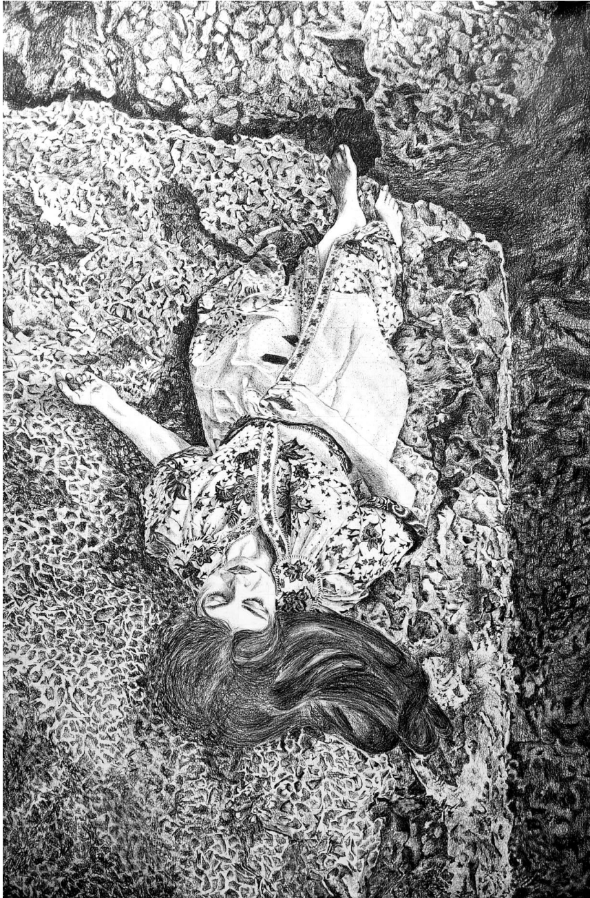
Soft Rock Firm Body, 2023 Graphite on paper 90 x 60 cm