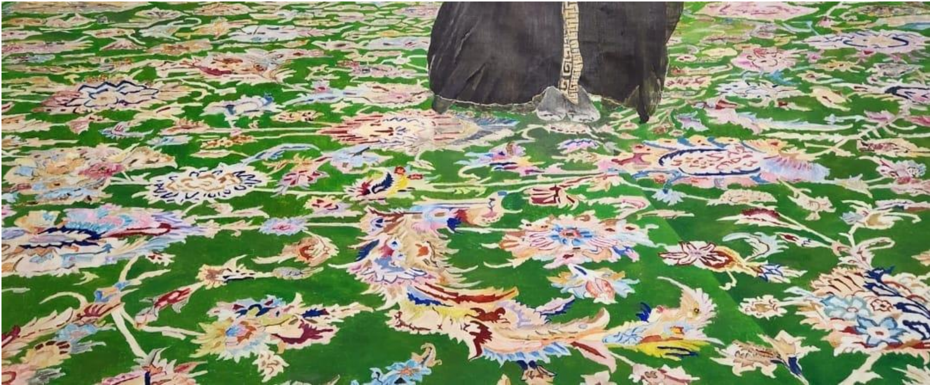
On the verge, between spaces, 2023 Oil on canvas 65 x 150 cm