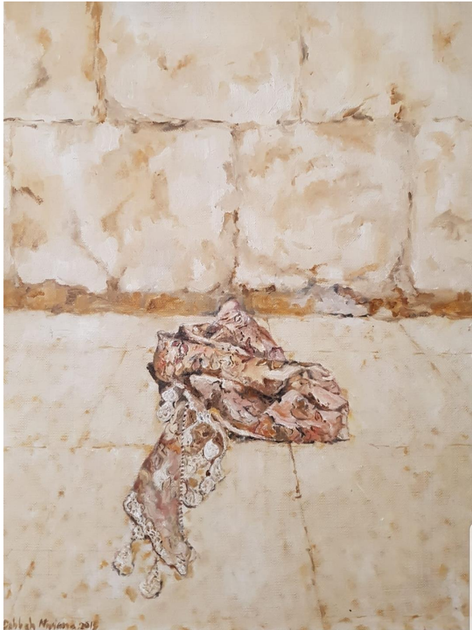
Shawl, 2019 Oil on canvas 40 x 30 cm