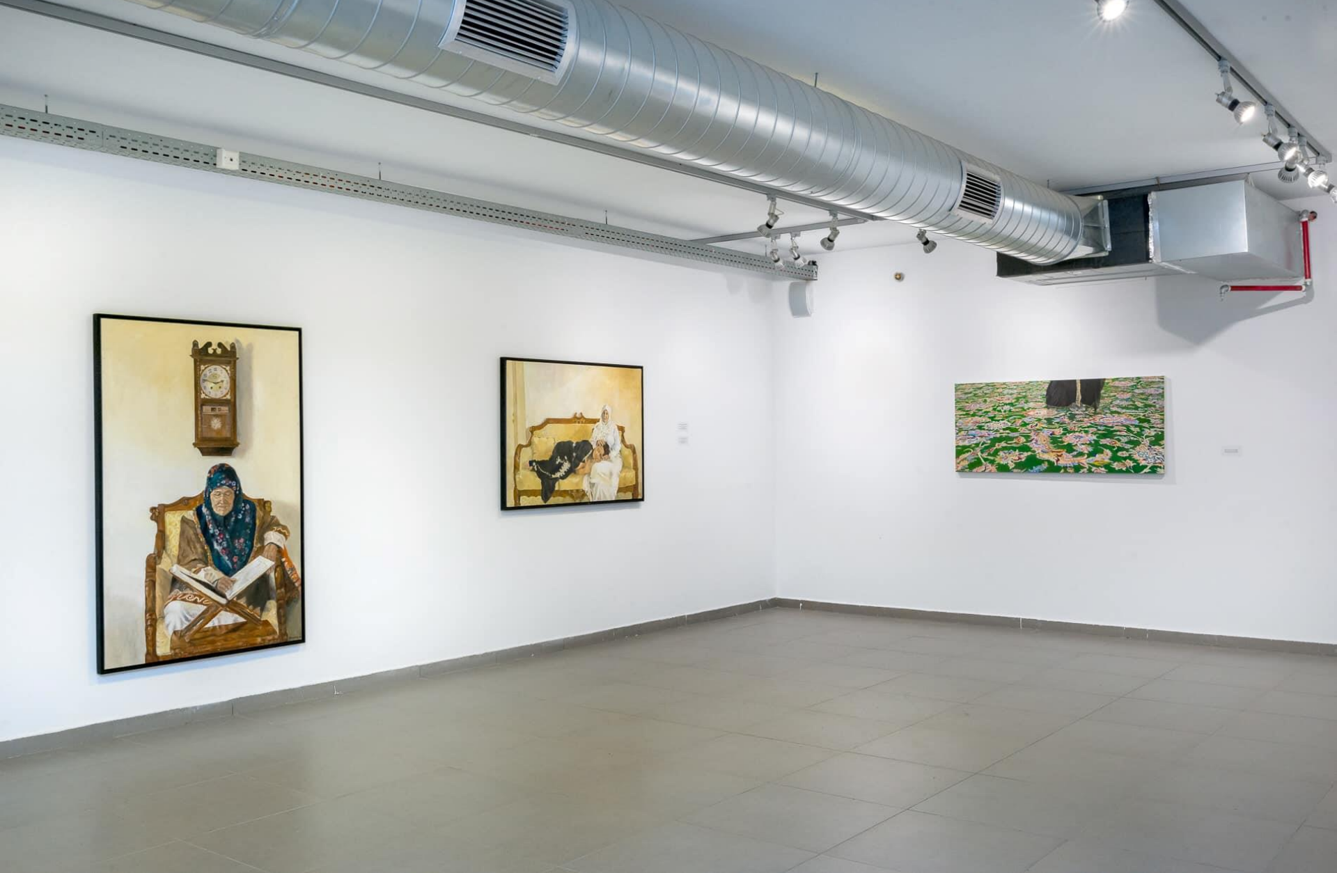
"In Between" – installation view, 2023 Solo exhibition by Assadi-Dabbah at Umm El-Fahem Gallery