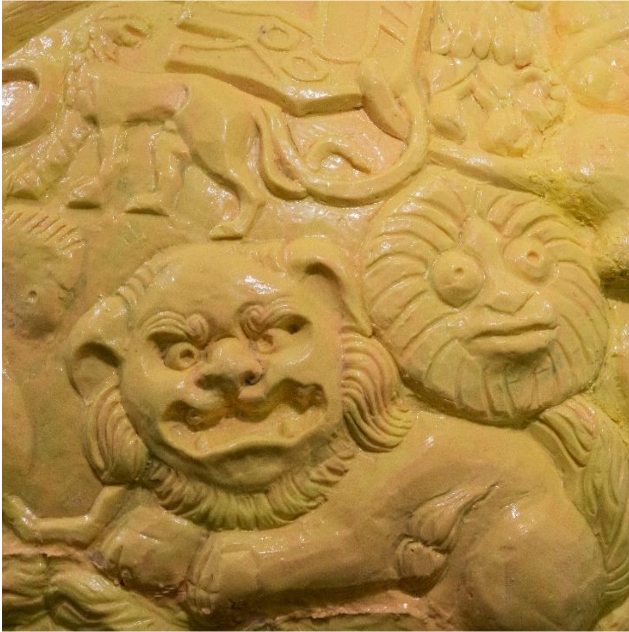
Foothold (detail), 2022 Polymers and pigments 160 cm diameter