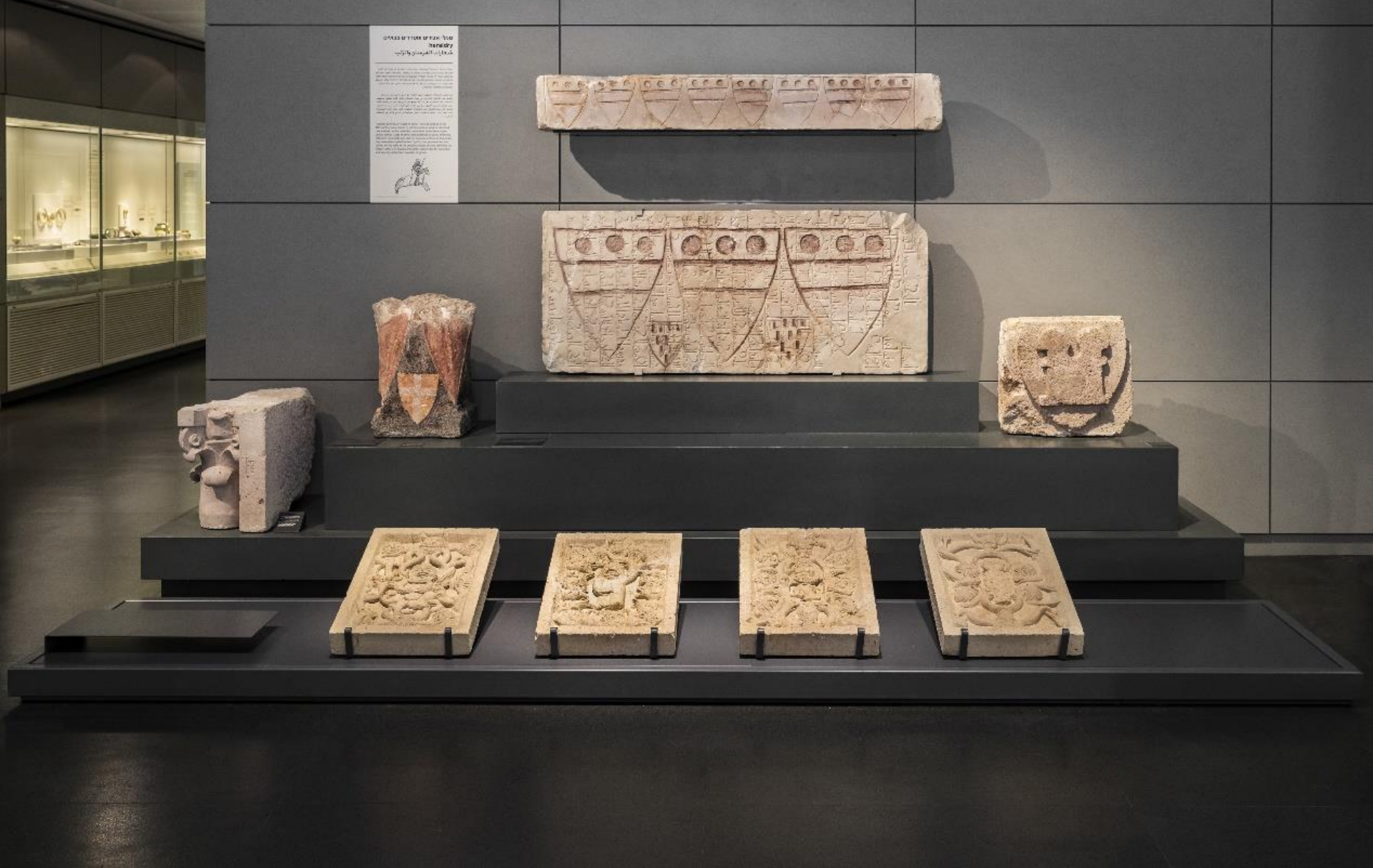
Them, 1999-2022 – installation view Sandstone plates, 4 units 53 x 40 x 8 cm each