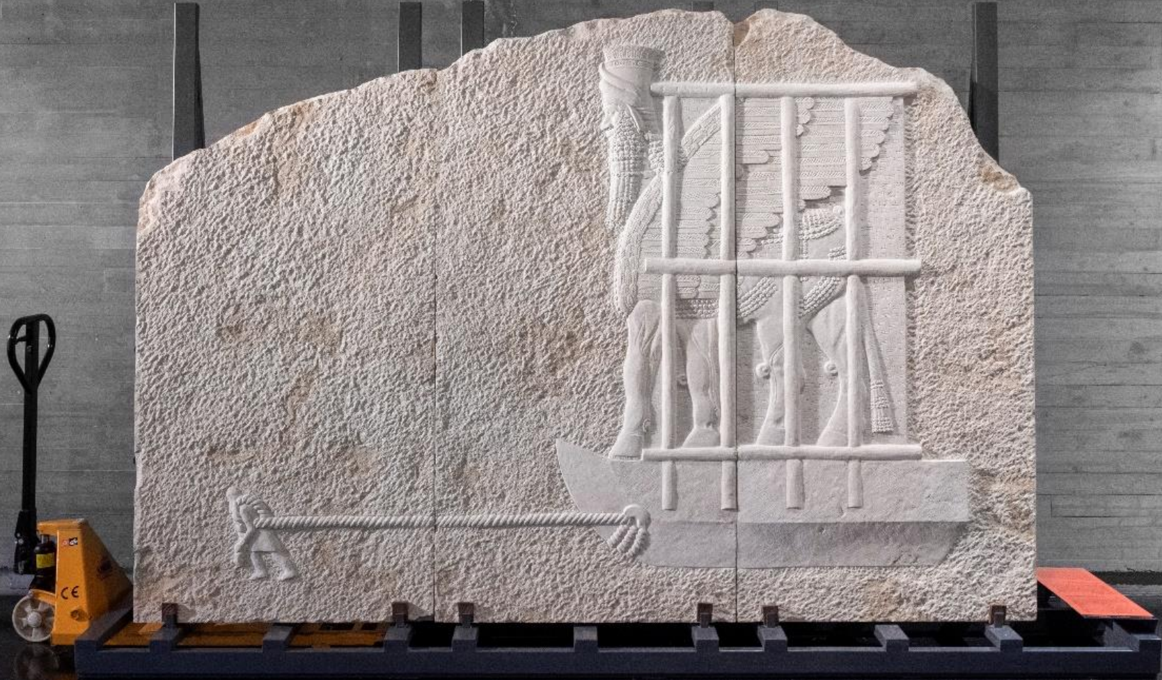
No Relief, 2022 – installation view Halila limestone, frame metal and jack pallet 218 x 405 x100 cm

Zohar Gotesman, "Disturbed Layer", Archeology Wing, Israel Museum, Jerusalem