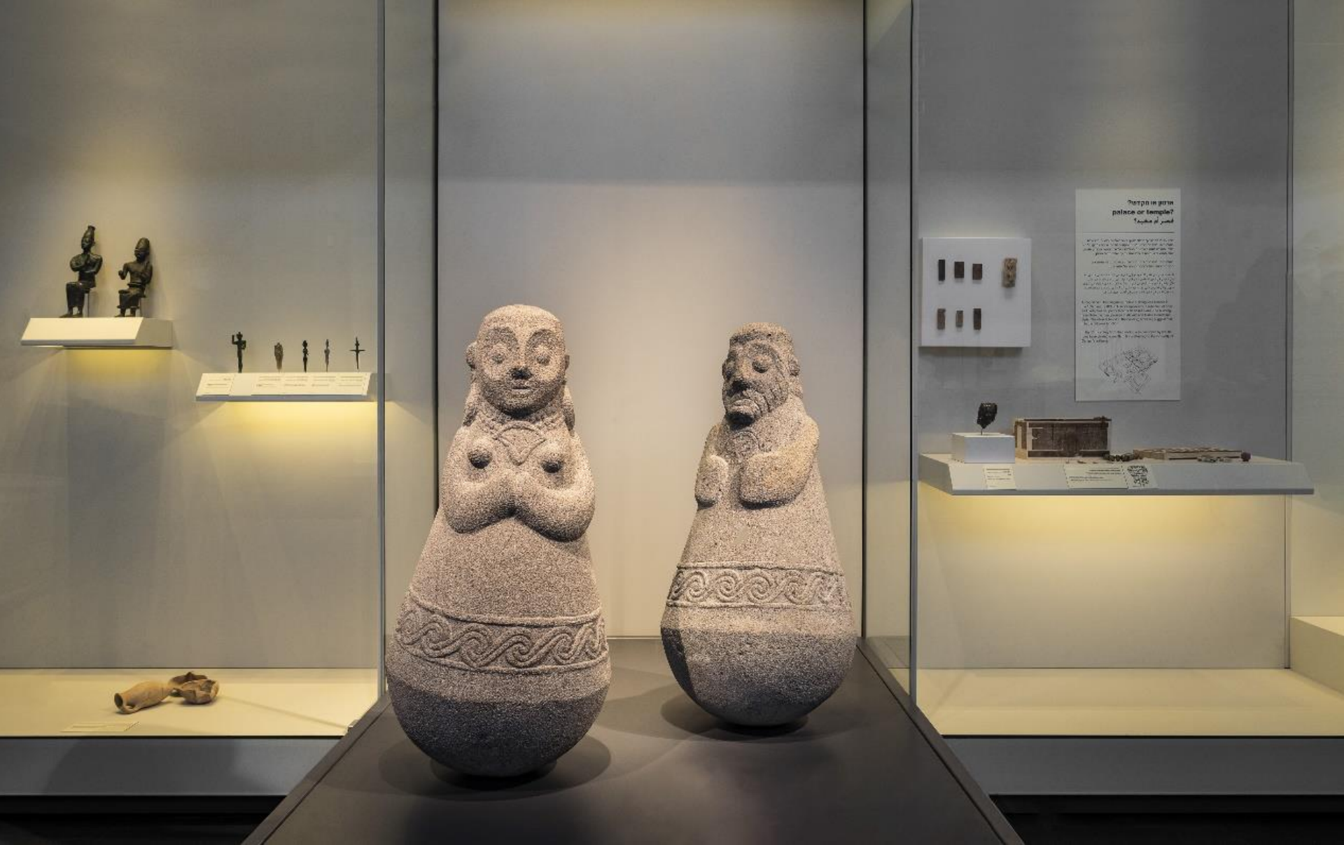
Rise and Fall, 2022 – installation view, Israel Museum Basalt 90 x 53 x 53 cm each