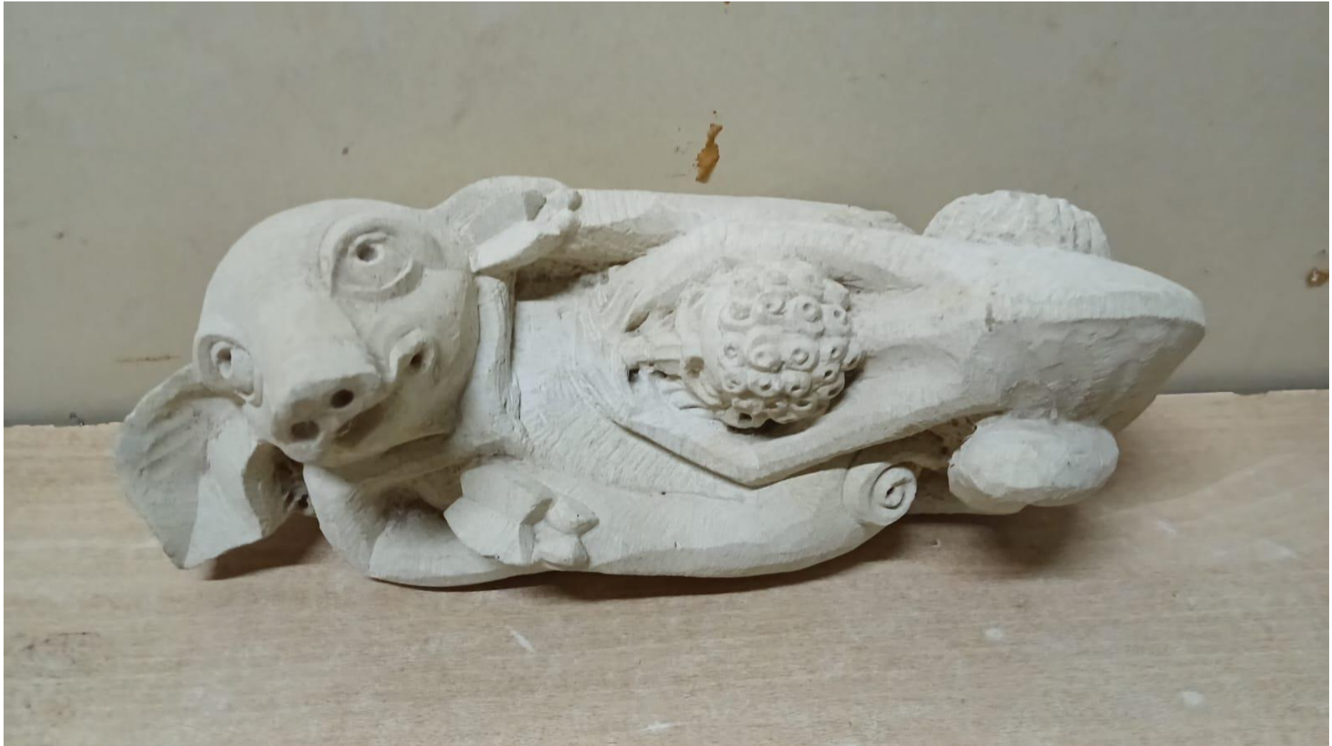
Untitled, 2017 Bamberger sandstone 39 x 17 x 13 cm