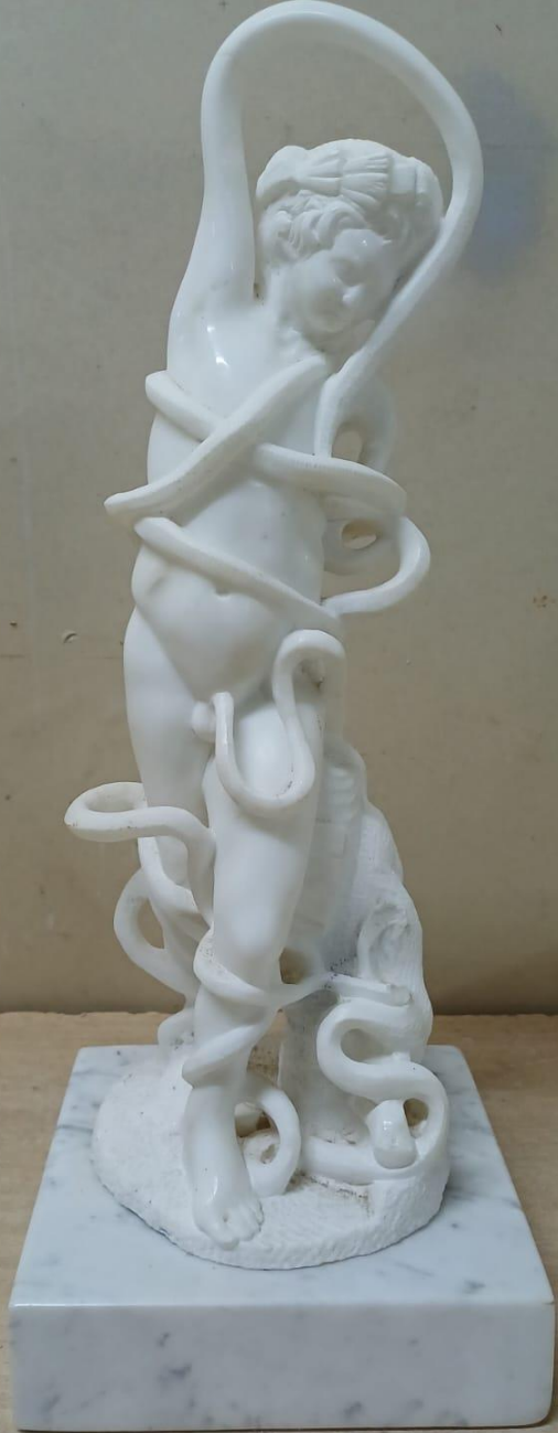
Syrinx Flute Tone (composition II), 2020 Carrera Statutario Marble 47 x 14 x 14 cm