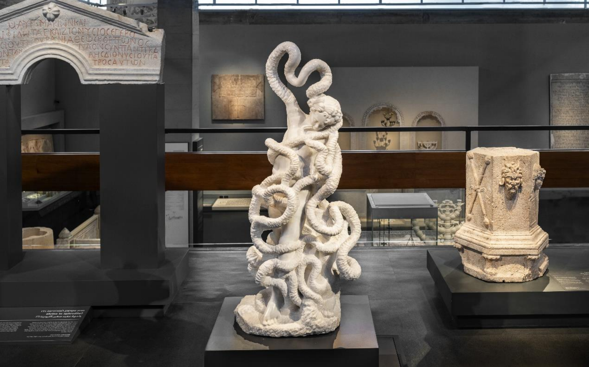
Sounds of the Syrx, 2022 – installation view, Israel Museum Carrara Statuario marble 135 x 60 x 40 cm