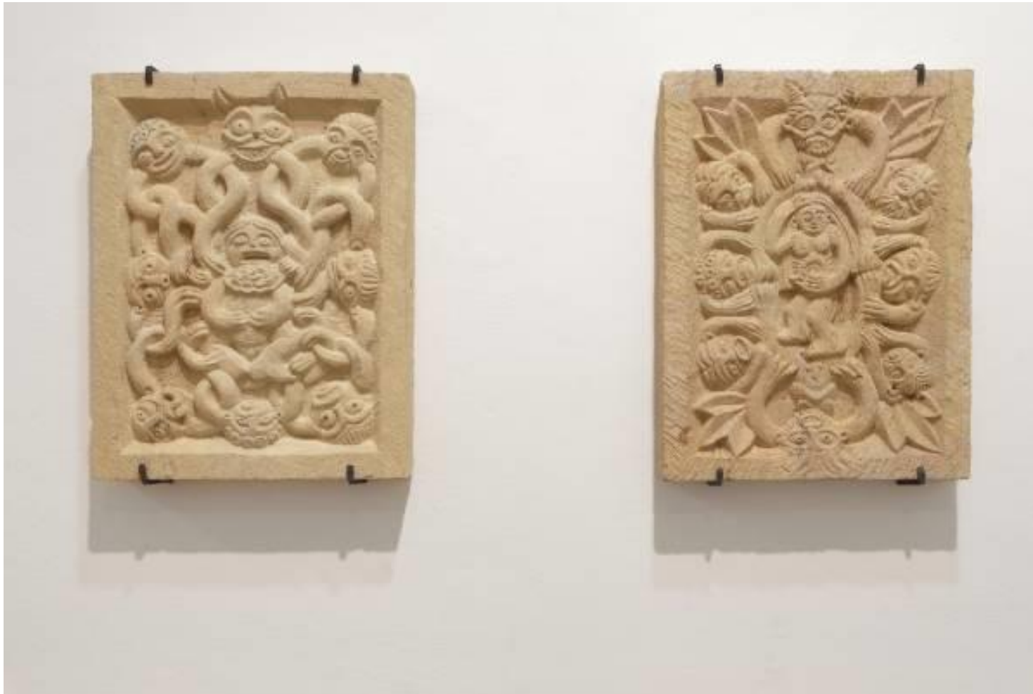
Them, 2018 Sandstone plates, 4 units 53 x 40 x 8 cm each