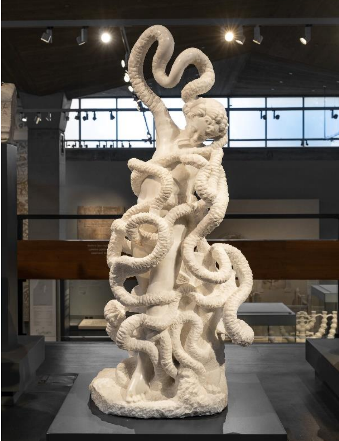
Sounds of the Syrinx, 2022 – installation view Carrara statuario marble 135 x 60 x 40 cm