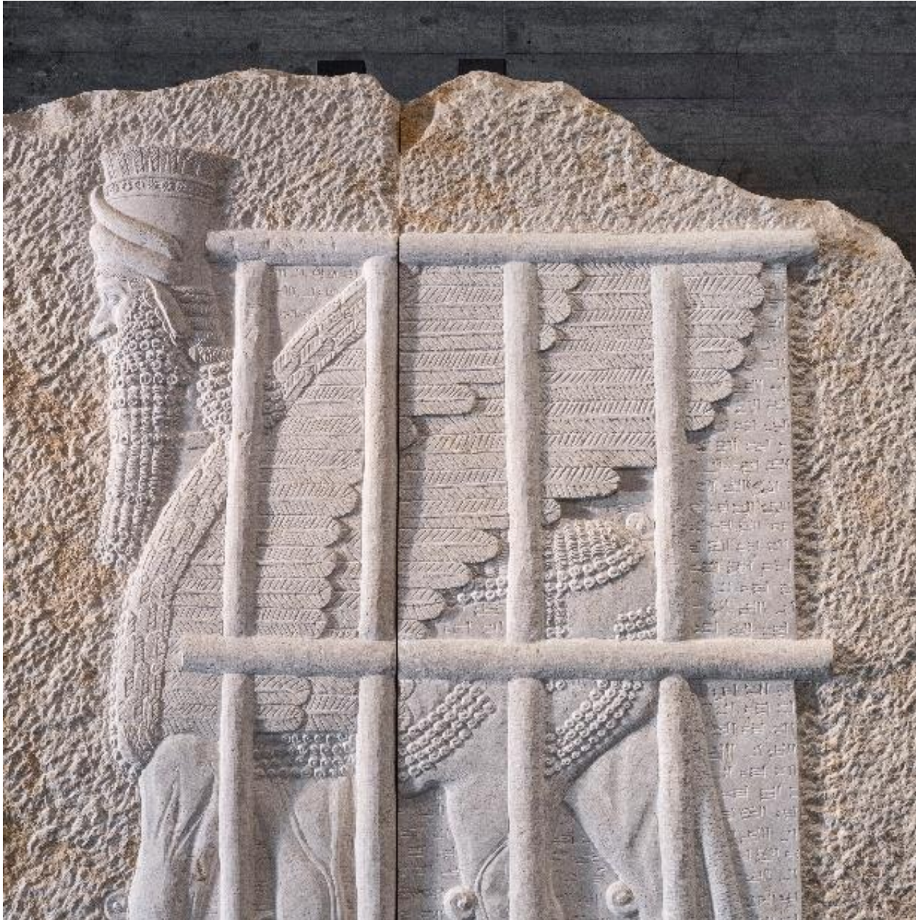
No Relief (detail), 2022 Halila limestone, frame metal, and jack pallet 218 x 405 x 100 cm