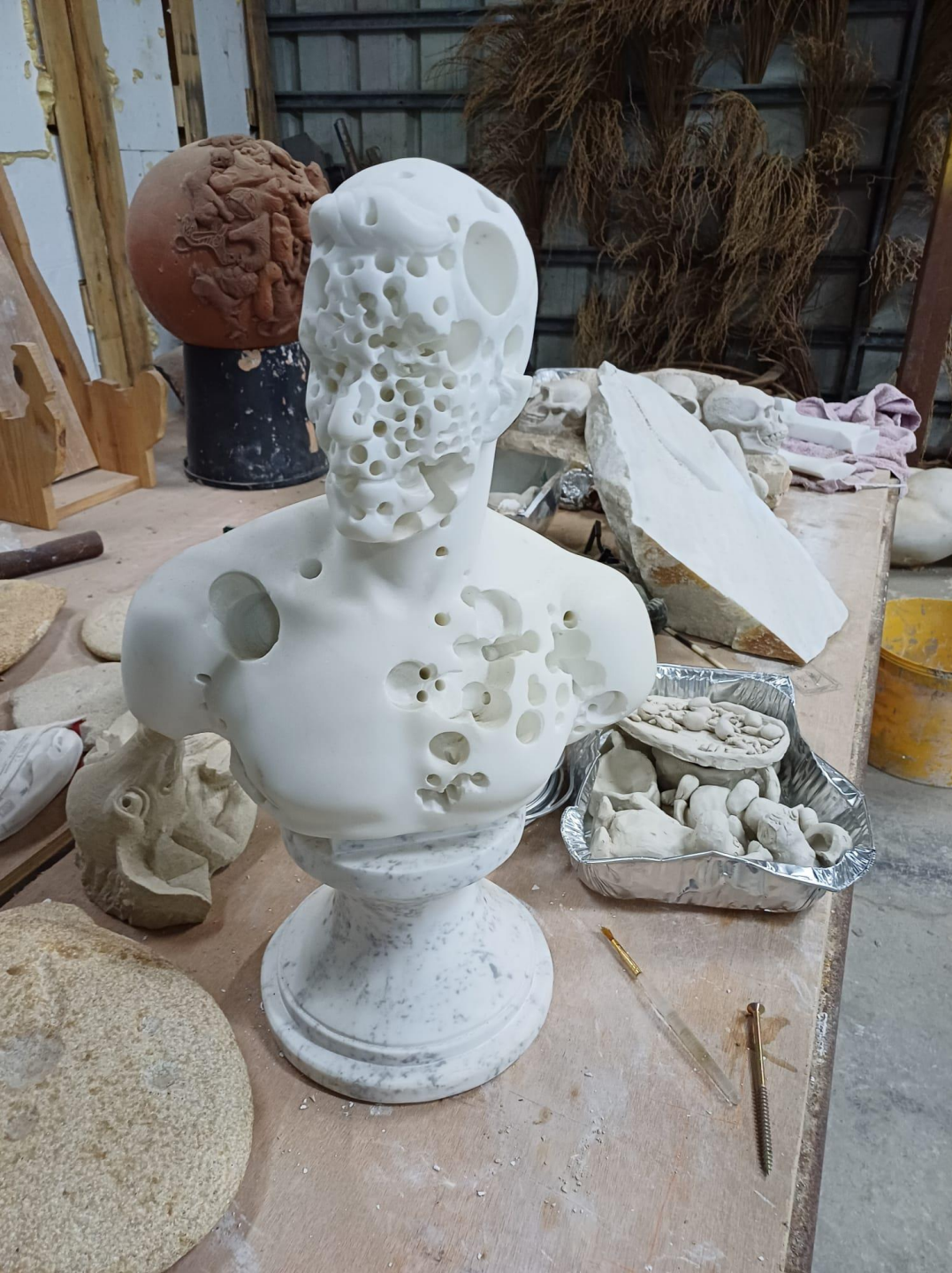
Untitled (Drillings), 2018 Carrara Marble 60 x 35 x 25 cm