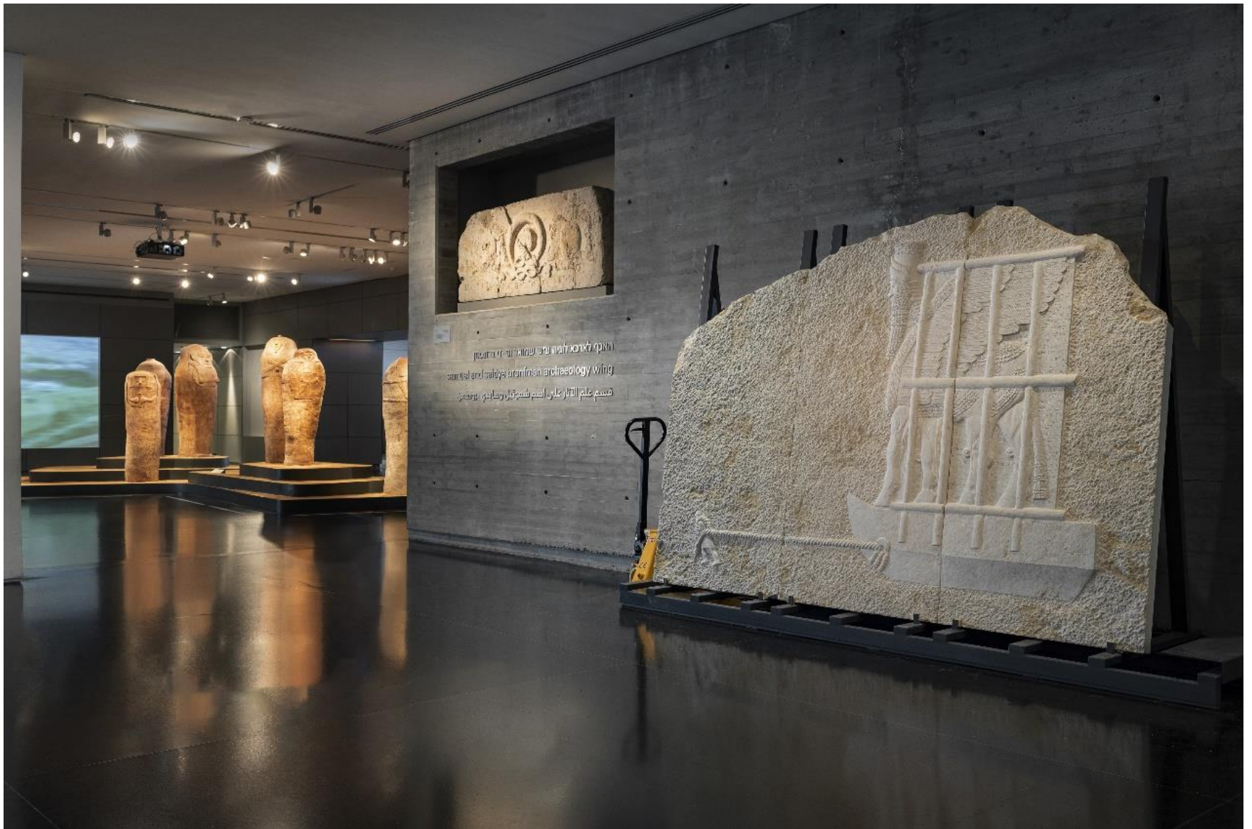
No Relief, 2022 – installation view Halila limestone, frame metal, and jack pallet 218 x 405 x 100 cm

Zohar Gotesman, "Disturbed Layer", Archeology Wing, Israel Museum, Jerusalem