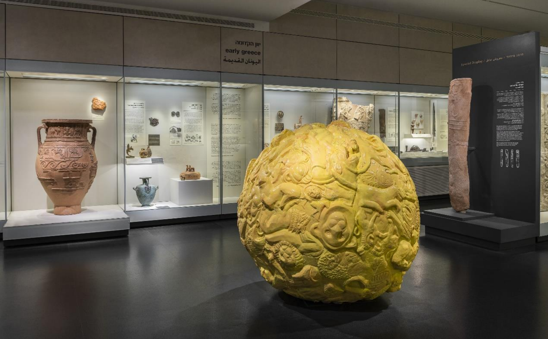
Foothold, 2022 – installation view Polymers and pigments 160 cm diameter