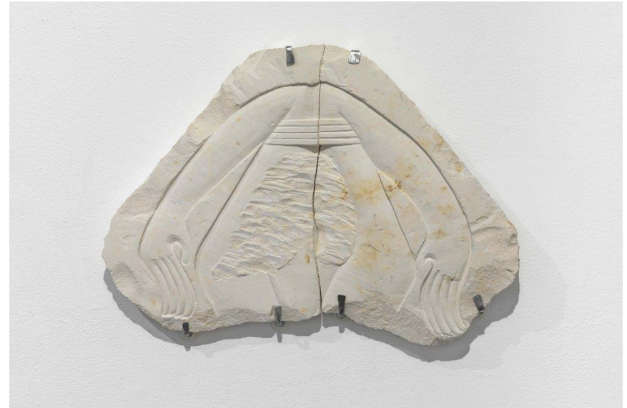
With a Mighty Hand, 2021 Limestone, a series of 8 30 x 40 x 2 cm each