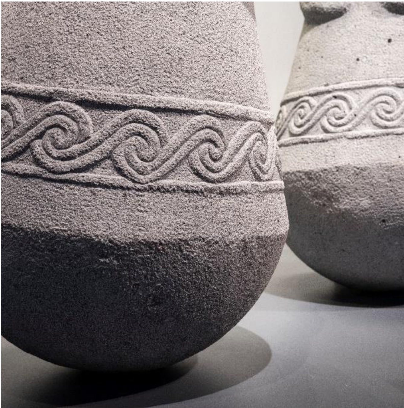
Rise and Fall (detail), 2022 Basalt 90 x 53 x 53 cm each