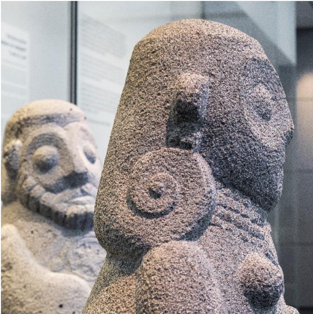
Rise and Fall (detail), 2022 Basalt 90 x 53 x 53 cm each