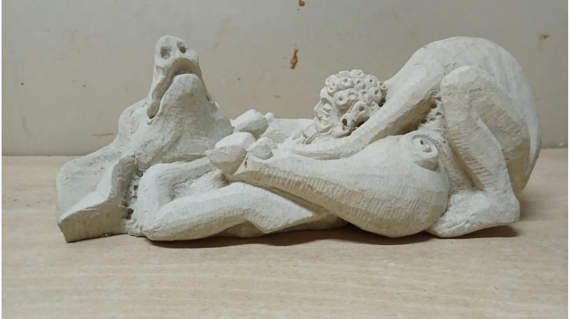
Untitled, 2017 Bamberger sandstone 39 x 17 x 13 cm