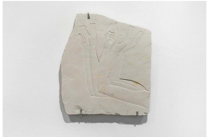
With a Mighty Hand, 2021 Limestone, a series of 8 30 x 40 x 2 cm each