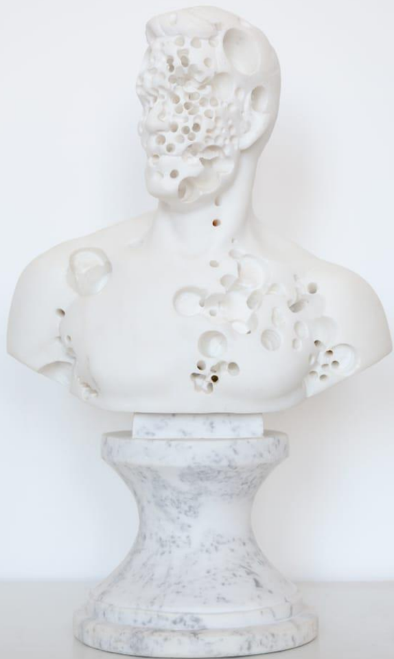
Untitled (Drillings), 2018 Carrera Marble 60 x 35 x 25 cm